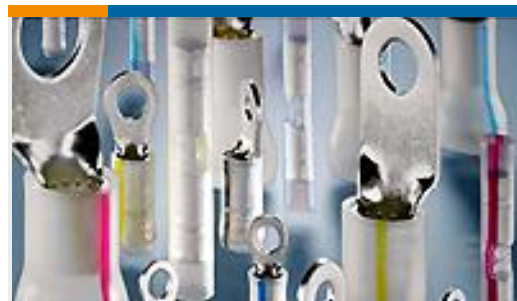
TE Part #696420-5 TERMINAL,PIDG PVF2 R 26-24 8