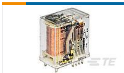
TE Part #2-1393766-7 R10-E1X8-V350=R10