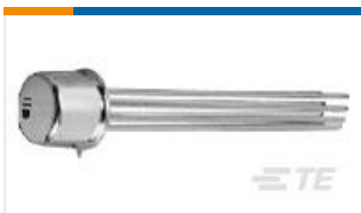
TE Part #3-1617351-6 JMACDG-26XP=M39016/15-093P