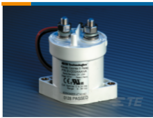
TE Part # 1618002-7 EV200AAANA=RELAY, EV200 SPST-N