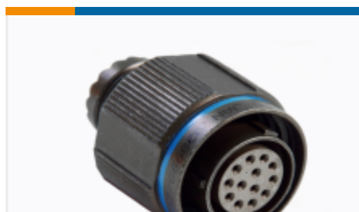
TE Part #YDTS26G11-02PNV001 D38999: Straight Plug, 11-02 Insert