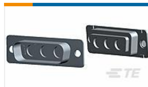
TE Part #448153-2 PLUG ASSY,SZ 2,COAX 3C3, NM