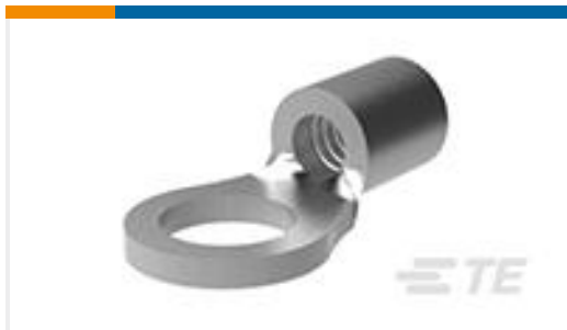
TE Part #2-322329-1 TERM, RING, STRATO-THERM, HT, 16-14, 6