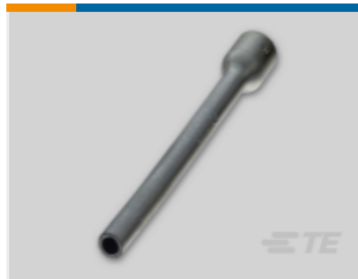
TE Part #808489-000 Low Profile Heat Shrink Boots: Poly Molded, Lipped, Straight