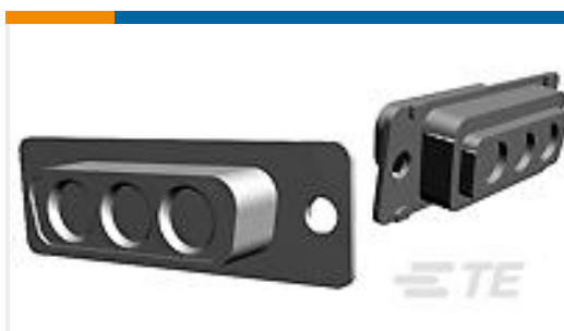
TE Part #445705-5 AMPLIMITE,RCPT ASY,3C3,2,NM