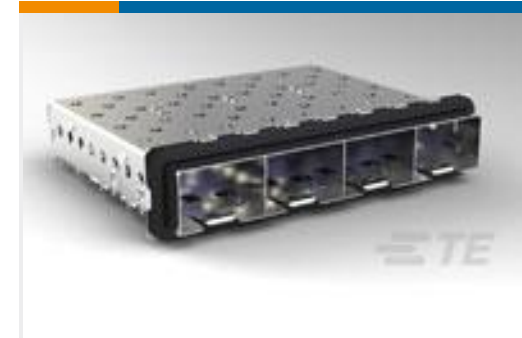
TE Part #2057833-1 SFP+ Enhanced 1x4 Cage Assy