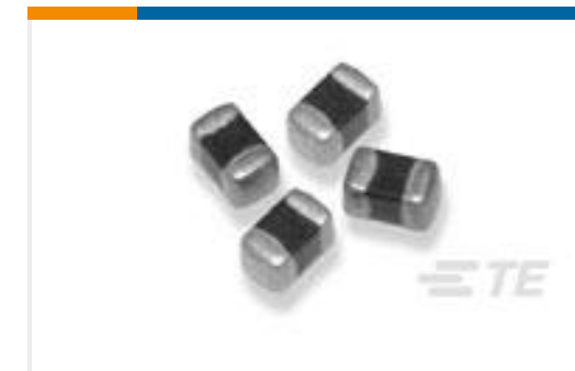
TE Part #2-1624116-6 BMB-A 0603 40R N8