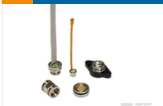
TE Part #154N-015G-R MEDIA ISOLATED PRESSURE STOCK LIST