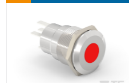
TE Part #2213765-7 AV19 SPM 5A SPOT LED RED 24V