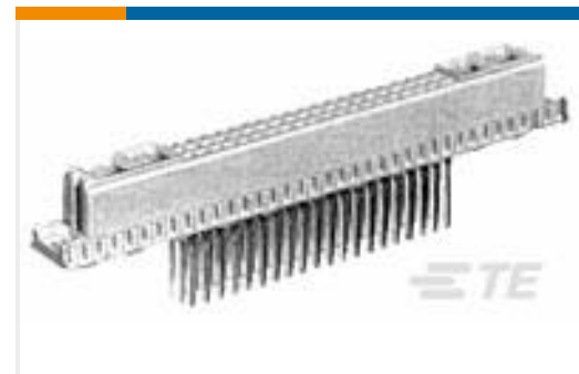
TE Part #148423-5 EURO TYPE M REC 42+6, THIN STK