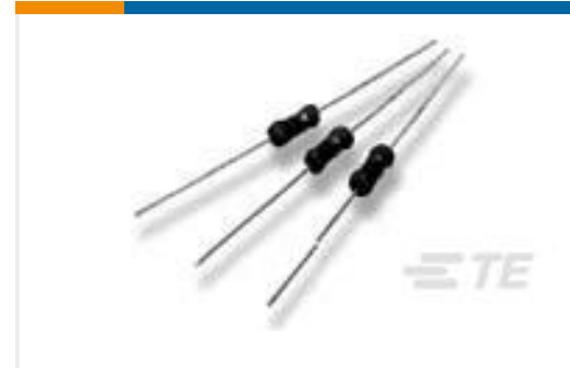
TE Part #4-1879352-7 RR02 5% 27R AMMO