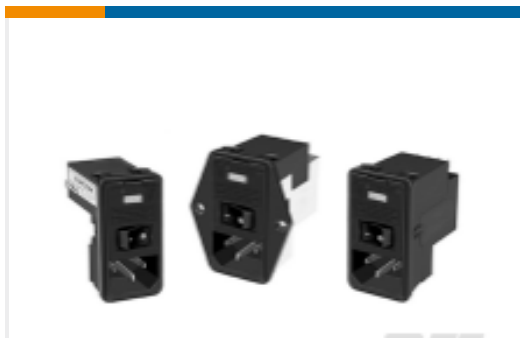
TE Part #1-6609106-4 CORCOM P SERIES MULTI-FUNCTION INLET FIL