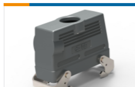
TE Part #T1280242132-000 H24B-TGBH-M32