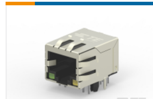
TE Part #2-2301994-3 RJ45 JACK INT.MAG. 1GB LED 1X1