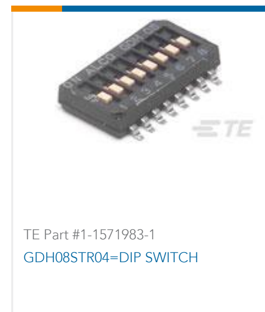
TE Part #1-1571983-1 GDH08STR04=DIP SWITCH