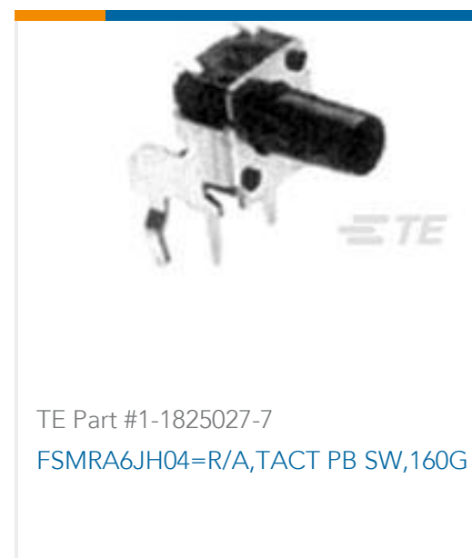
TE Part #1-1825027-7 FSMRA6JH04=R/A, TACT PB SW, 160G