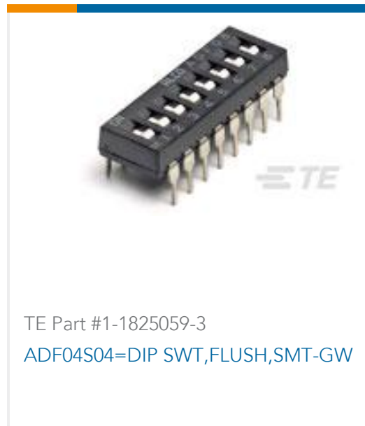
TE Part #1-1825059-3 ADF04S04=DIP SWT, FLUSH, SMT-GW