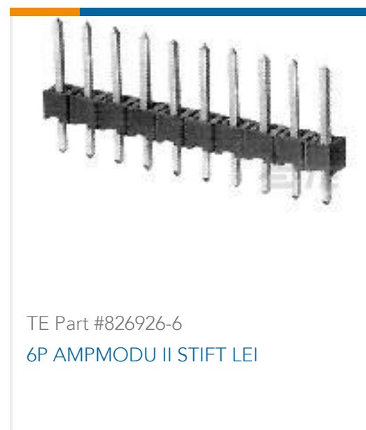
TE Part #826926-6 6P AMPMODU II STIFT LEI