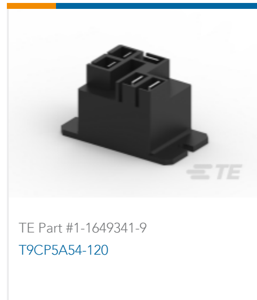
TE Part #1-1649341-9 T9CP5A54-120