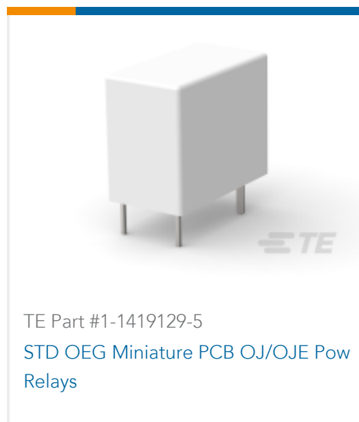
TE Part #1-1419129-5 STD OEG Miniature PCB OJ/OJE Pow Relays