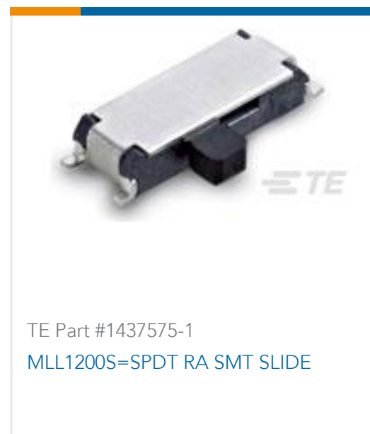
TE Part #1437575-1 MLL1200S=SPDT RA SMT SLIDE