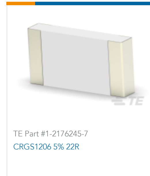
TE Part #1-2176245-7 CRGS1206 5% 22R