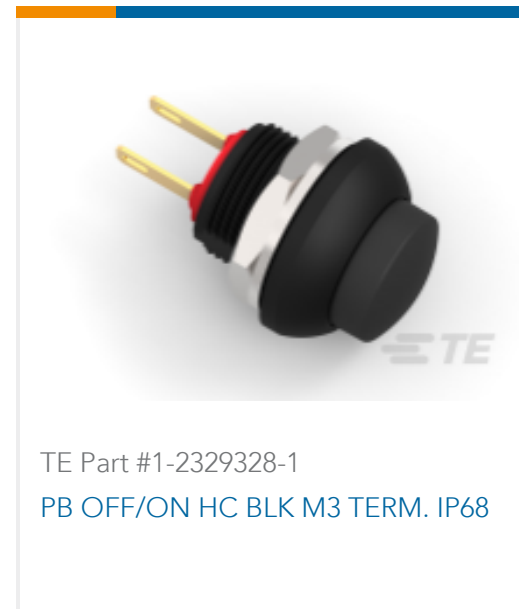
TE Part #1-2329328-1 PB OFF/ON HC BLK M3 TERM. IP68