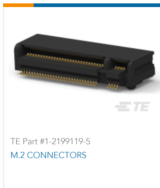
TE Part #1-2199119-5 M.2 CONNECTORS