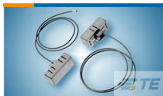
TE Part #1-1513472-5 UAM ASSEMBLY 270MM CABLE W /MHF4L CONN