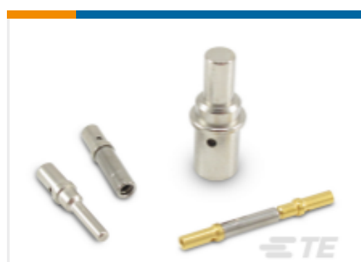
TE Part #0462-209-16141 DEUTSCH SOLID CONTACTS