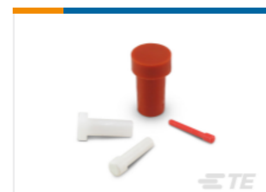
TE Part #114017-ZZ DEUTSCH SEALING PLUGS