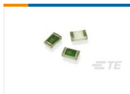
TE Part #1-1879126-4 RN 0402 124R 0.1% 10PPM 1K RL