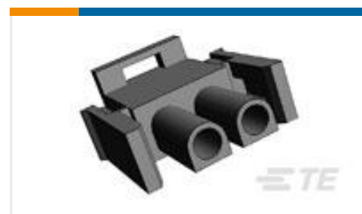
TE Part #1-480698-0 02P UMNL PLUG HSG NATL