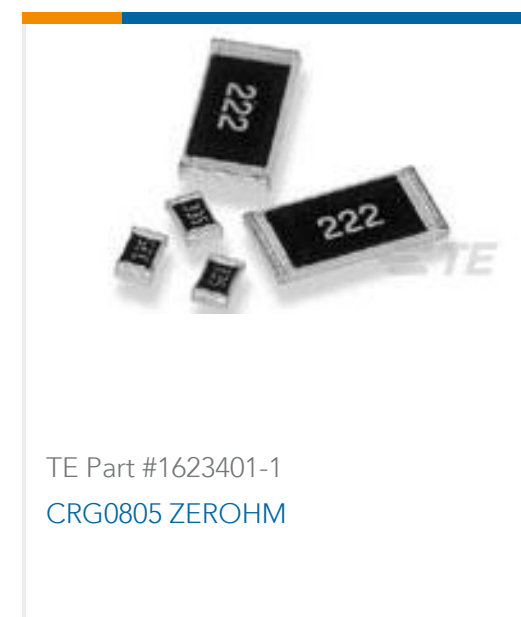
TE Part #1623401-1 CRG0805 ZEROHM