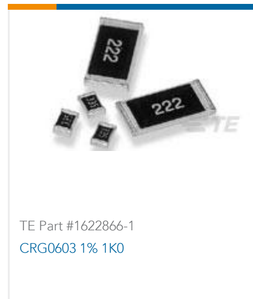
TE Part #1622866-1 CRG0603 1% 1K0