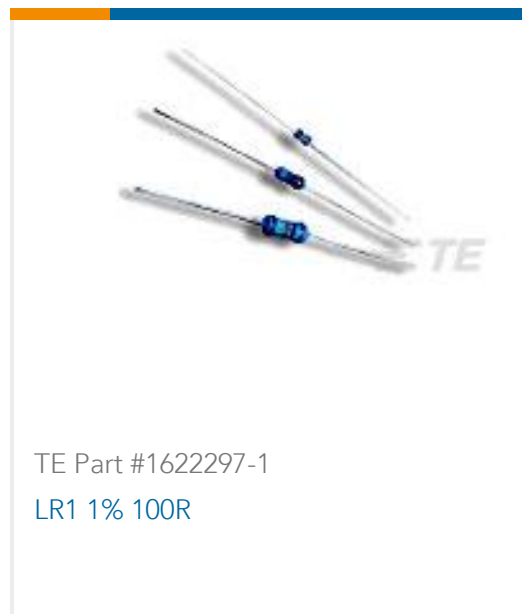
TE Part #1622297-1 LR1 1% 100R