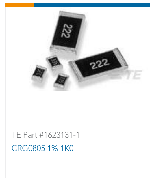
TE Part #1623131-1 CRG0805 1% 1K0