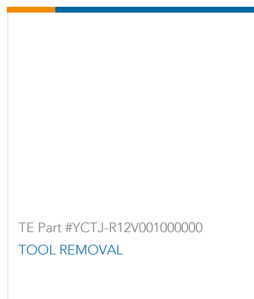
TE Part #YCTJ-R12V001000000 TOOL REMOVAL