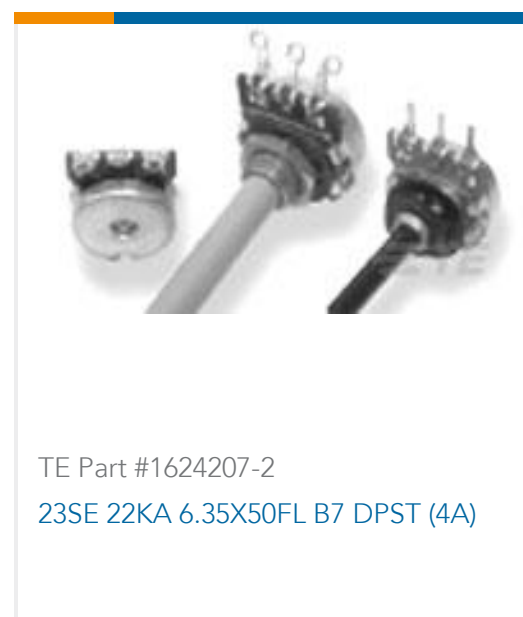
TE Part #1624207-2 23SE 22KA 6.35X50FL B7 DPST (4A)