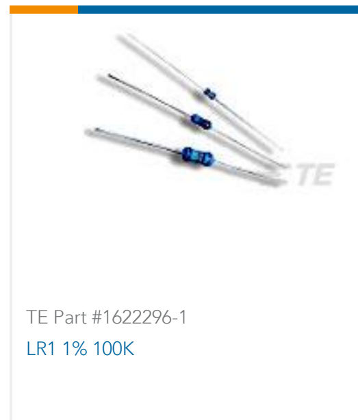
TE Part #1622296-1 LR1 1% 100K