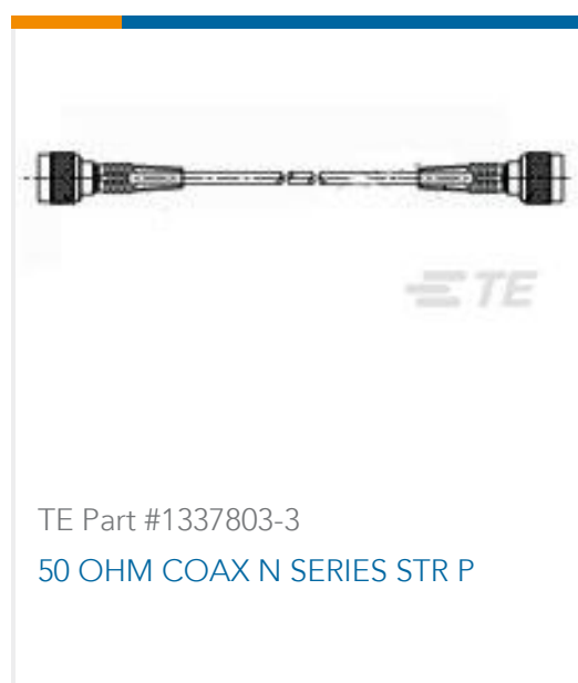
TE Part #1337803-3 50 OHM COAX N SERIES STR P