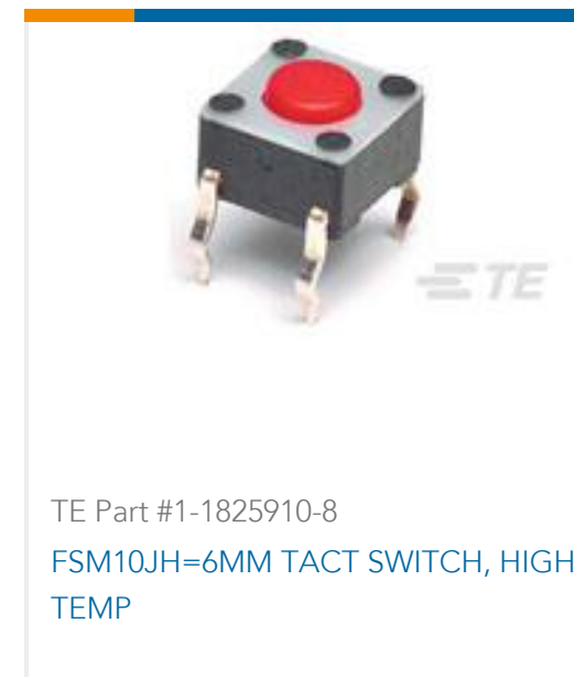
TE Part #1-1825910-8 FSM10JH=6MM TACT SWITCH, HIGH TEMP