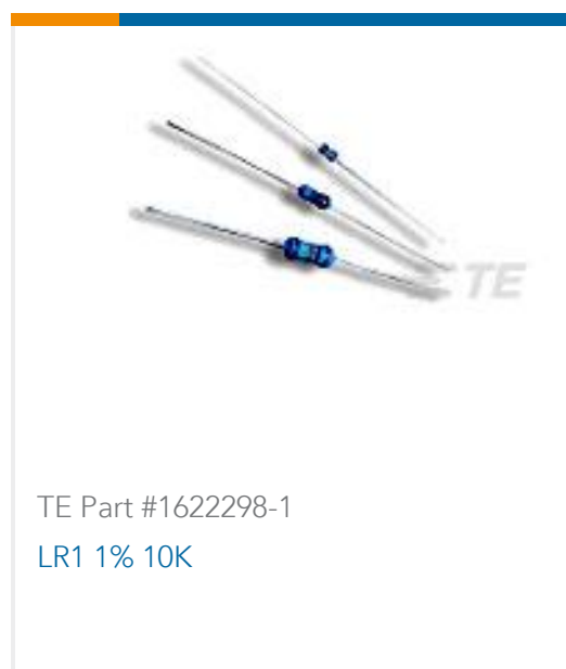
TE Part #1622298-1 LR1 1% 10K