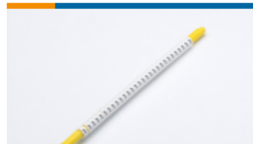
TE Part #362886-000 STD SNAP-ON MARKERS