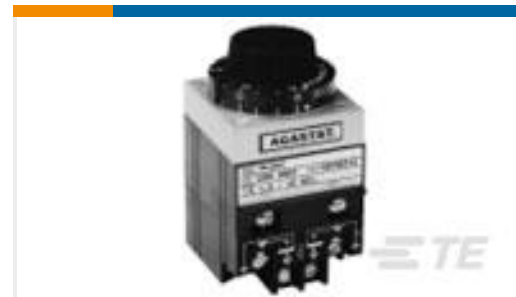
TE Part #1423157-5 7012AC=RLY,STD,ON,2P,120VAC,15