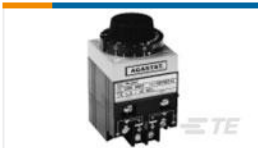
TE Part #1423162-2 7022AB=RLY,STD,OFF,2P,120VAC,5