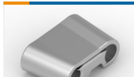
TE Part #109433-1 AMPACT ASSY,1272ACSR/954ACSR