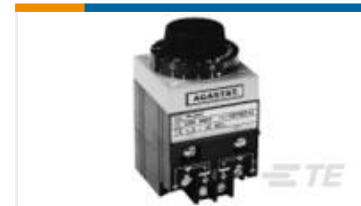
TE Part #1423157-7 7012ACLL=RLY,STD,ON,2P,120VAC