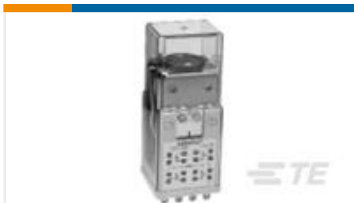
TE Part #1423156-1 GPI=RLY,120VAC