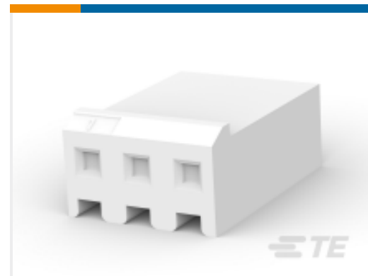
TE Part #1-770849-2 3.96mm Wire-to-board housing: receptacle, with mating alignment, SL 156