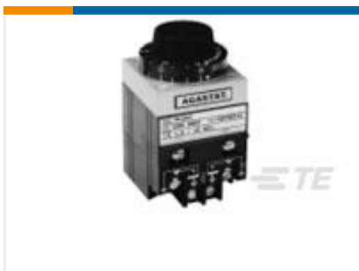
TE Part #1423165-1 7024AA=RLY,STD,OFF,4P,120VAC,1