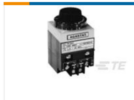
TE Part #1423157-7 7012ACLL=RLY,STD,ON,2P,120VAC