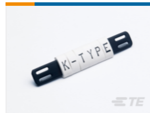
TE Part #EC6528-000 K-TYPE TIE-ON MARKERS