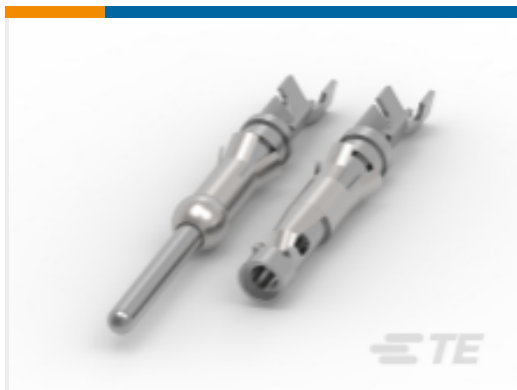
TE Part #1-66101-9 TYPE III CONTACTS LP