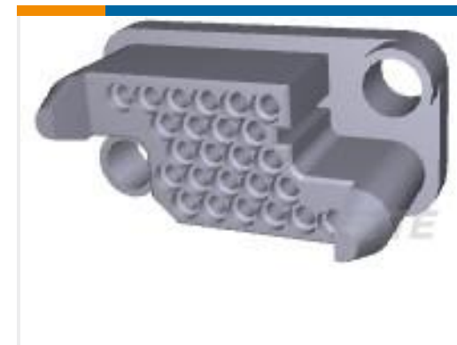
TE Part #211150-1 METRIMATE SKT HSG 25P