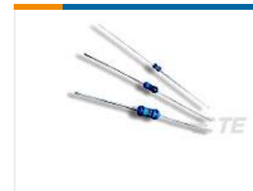
TE Part #1622727-1 LR2 1% 2K7