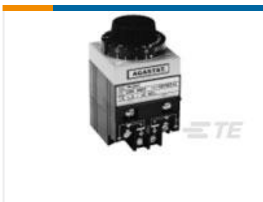
TE Part #1423157-6 7012ACL=RLY,STD,ON,2P,120VAC,1