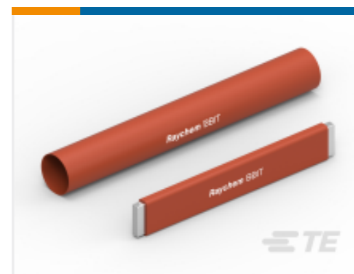
TE Part #957749-000 Busbar Insulation Tubing up to 35 kV