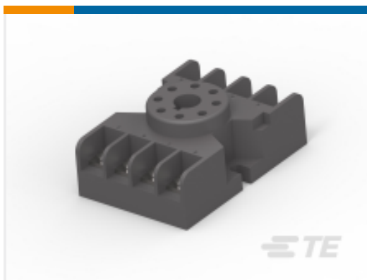
TE Part #1393143-6 27E122=SOCKET,KRP,8,SCW,PLES