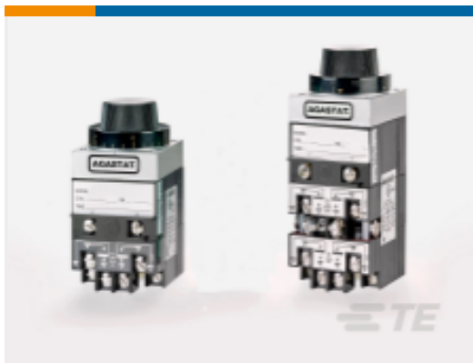
TE Part # 1-1423162-8 7022AK=RLY,STD,OFF,2P,120VAC,1