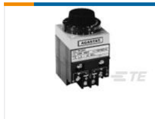
TE Part #1423157-2 7012AB=RLY,STD,ON,2P,120VAC,5S