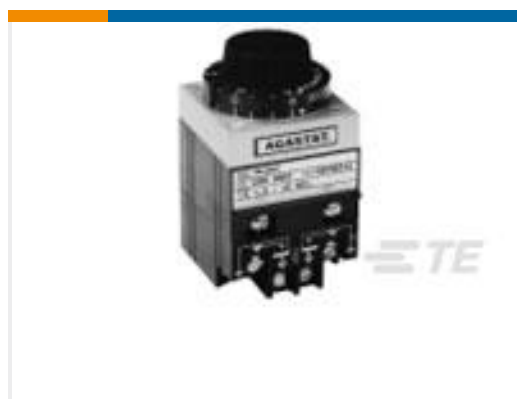
TE Part #1423157-8 7012AD=RLY,STD,ON,2P,120VAC,50