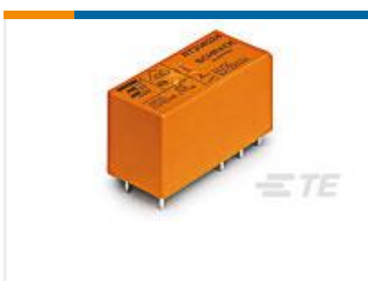
TE Part #1-1419108-7 RT424024F