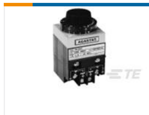
TE Part #1-1423164-9 7022PB=RLY,STD,OFF,2P,125VDC,5