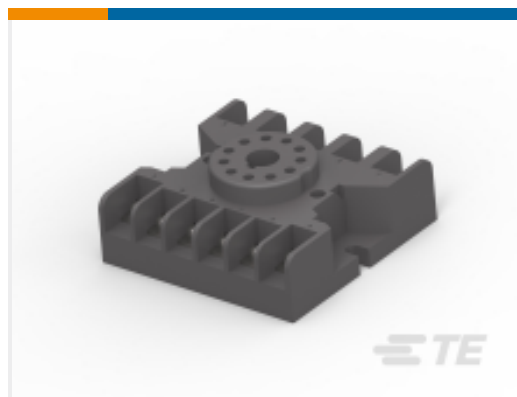
TE Part #1393143-7 27E123=SOCKET,KRP,11,SCW,PLE