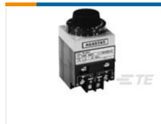
TE Part #1423157-5 7012AC=RLY,STD,ON,2P,120VAC,15