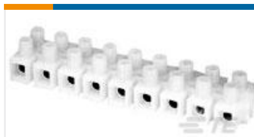
TE Part #1776313-1 TSB200001DS=EUROPA T-BL,14.5MM