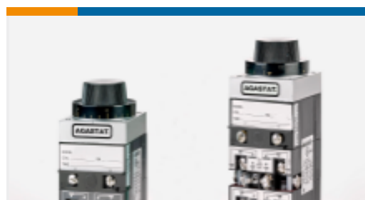
TE Part #1-1755150-4 7012AELY1=RLY,STD,ON,2P,120V, 200S,L,Y1