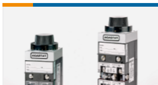
TE Part #1-1423183-9 7032ADB=RLY,STD,DBH,2P,120VAC, 100SEC,7SC