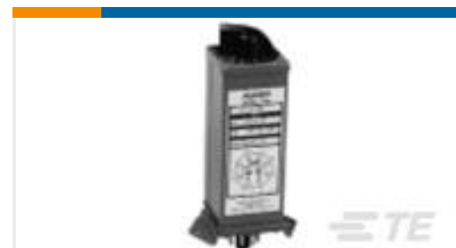
TE Part #1423152-1 2112D4YF=RLY,MINI,ON,2P,125VDC