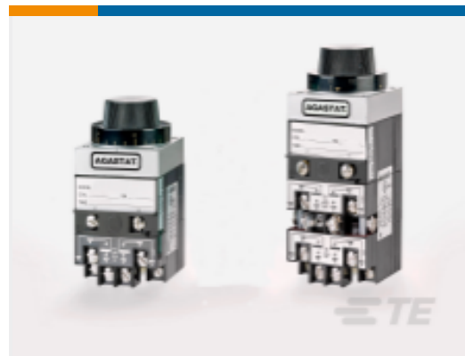
TE Part # 1423162-5 7022AC=RLY,STD,OFF,2P 120VAC,1