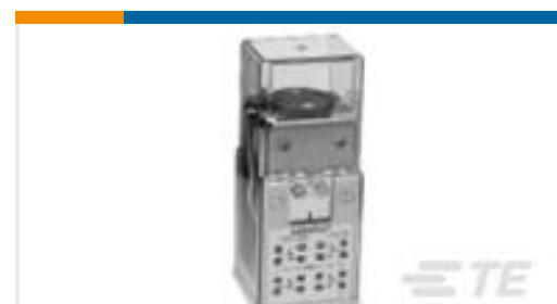
TE Part #1423156-4 GPIN=RLY,120VAC,BOD