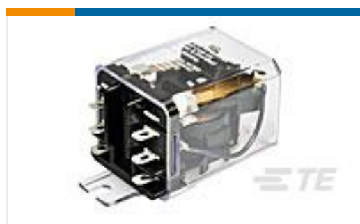
TE Part #1393115-1 KUIP-11A15-120=KU