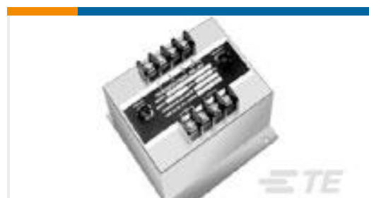
TE Part #1618113-1 WUVT3-120=WILMAR UNDERVOLTAGE