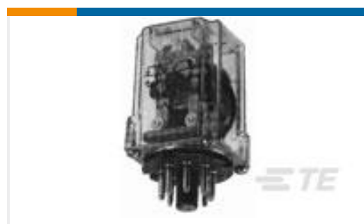
TE Part #9-1393101-7 KRP-14AG-24=KA/KB/KC/KR