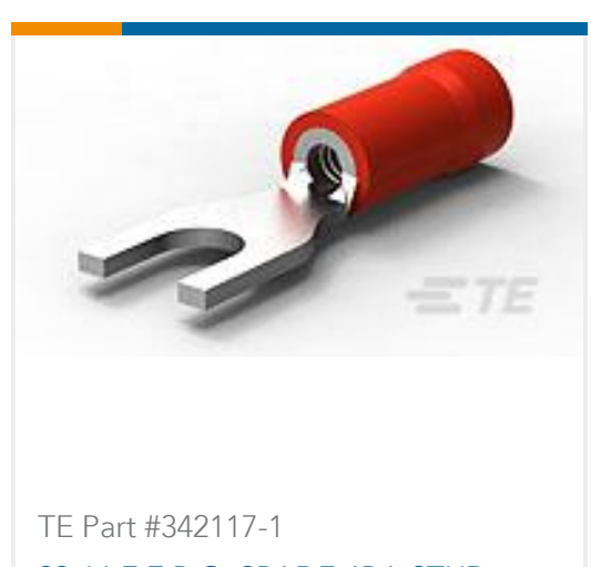
22-16 F.E.P.G. SPADE 4BA STUD