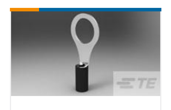
TE Part #342066