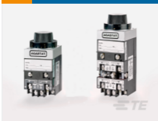
TE Part # 1423157-5 7012AC=RLY,STD,ON,2P,120VAC,15