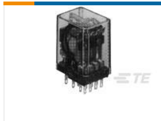
TE Part #5-1393123-2 KHU-17D16-24=KH