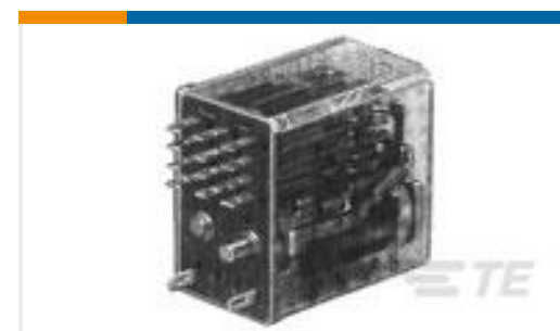
TE Part #9-1393765-2 R10-E1W4-S1.8K=R10