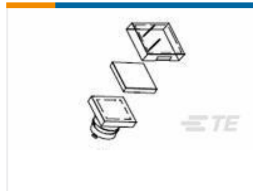
TE Part #7-1437569-9 64S2=COLOR PB CAP RED SQ