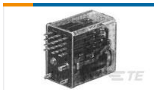
TE Part #7-1393769-7 R10S-E1Y4-J1.0K=R10