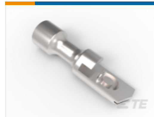
TE Part #53631-1 AMPOWER KNIFE DISCONNECT