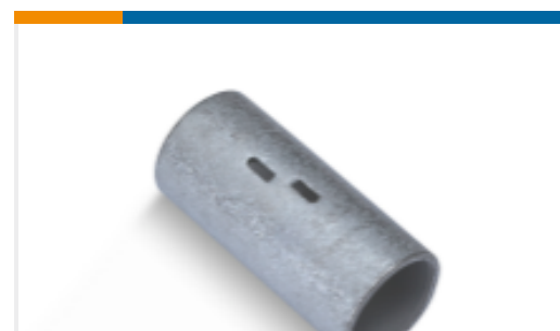
TE Part #324457 AMPOWER BUTT SPLICE