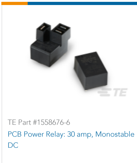
TE Part #1558676-6 PCB Power Relay: 30 amp, Monostable DC