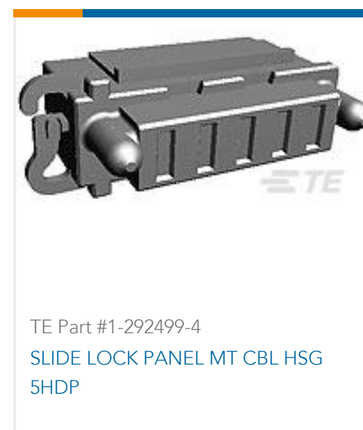
TE Part #1-292499-4 SLIDE LOCK PANEL MT CBL HSG 5HDP