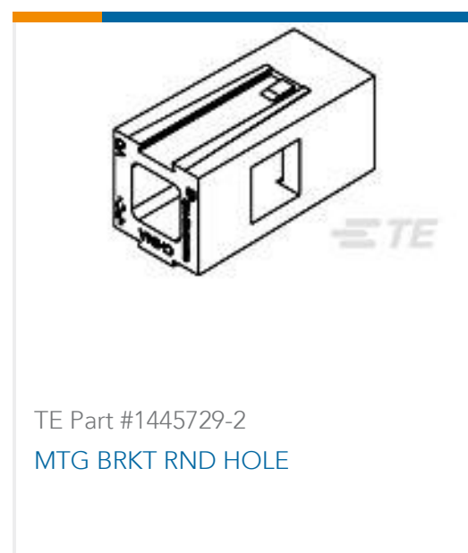
TE Part #1445729-2 MTG BRKT RND HOLE