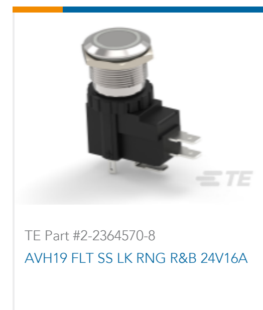
TE Part #2-2364570-8 AVH19 FLT SS LK RNG R&B 24V16A