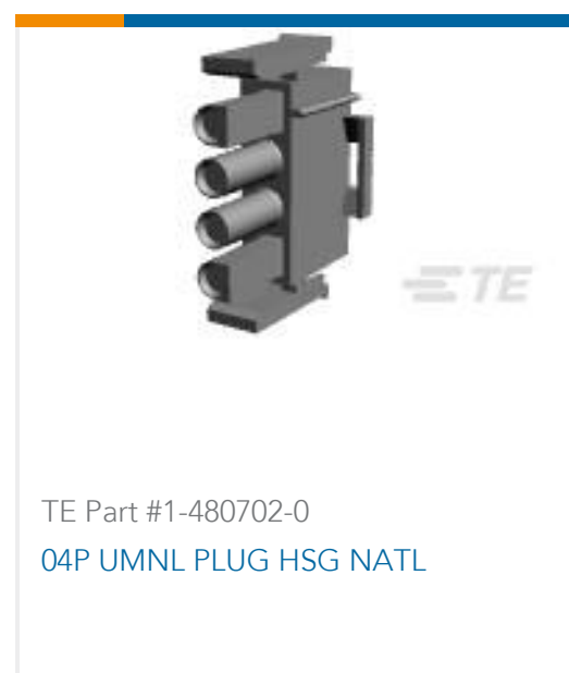
TE Part #1-480702-0 04P UMNL PLUG HSG NATL