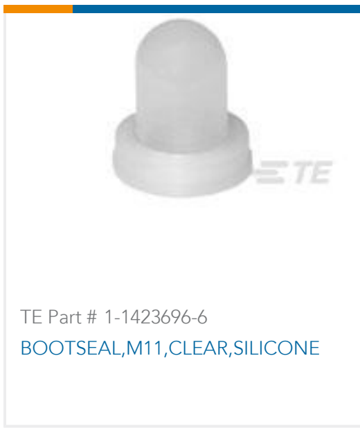
TE Part # 1-1423696-6 BOOTSEAL, M11, CLEAR, SILICONE