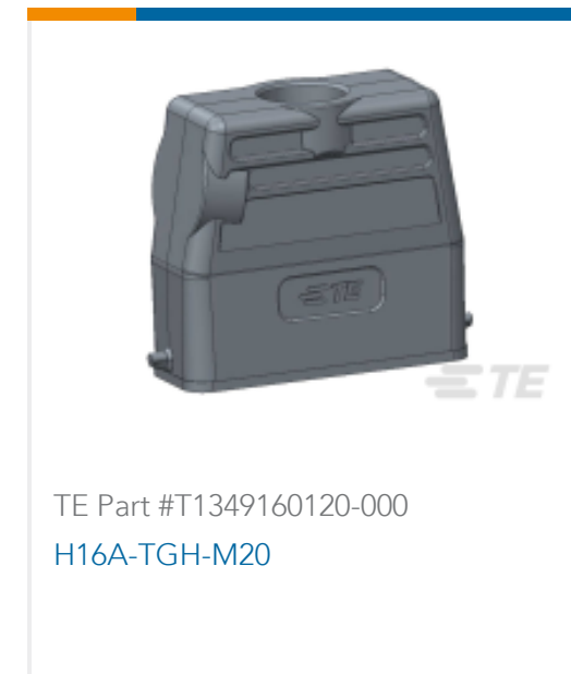
TE Part #T1349160120-000 H16A-TGH-M20