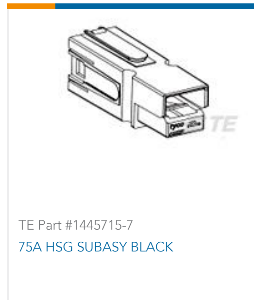
TE Part #1445715-7 75A HSG SUBASY BLACK