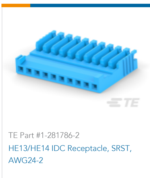
TE Part #1-281786-2 HE13/HE14 IDC Receptacle, SRST, AWG24-2