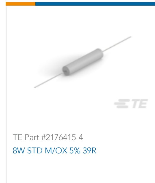
TE Part #2176415-4 8W STD M/OX 5% 39R