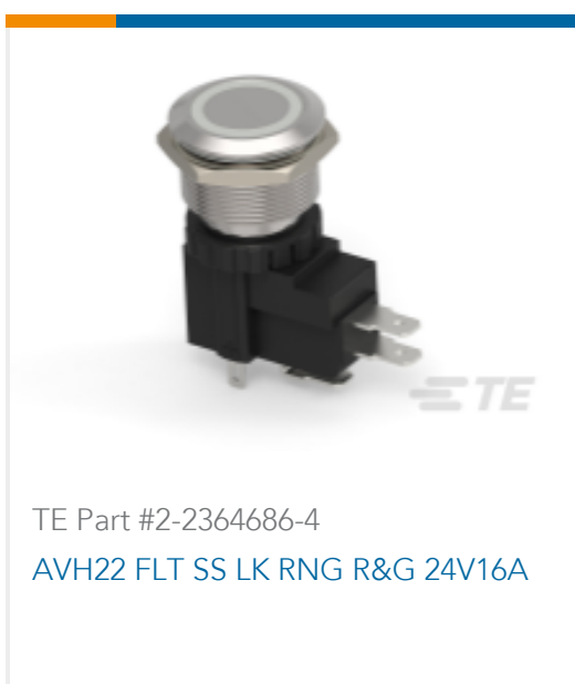
TE Part #2-2364686-4 AVH22 FLT SS LK RNG R&G 24V16A