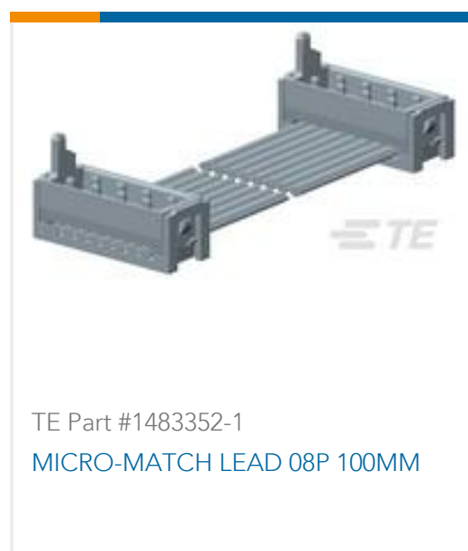
TE Part #1483352-1 MICRO-MATCH LEAD 08P 100MM