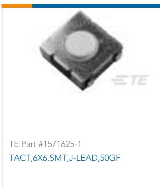
TE Part #1571625-1 TACT,6X6,SMT,J-LEAD,50GF