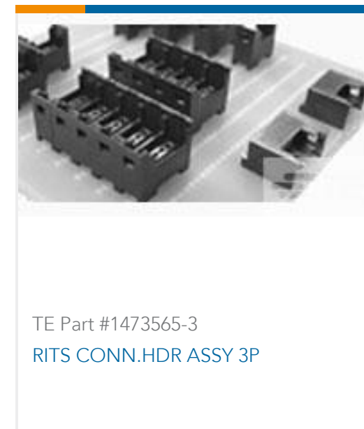
TE Part #1473565-3 RITS CONN.HDR ASSY 3P