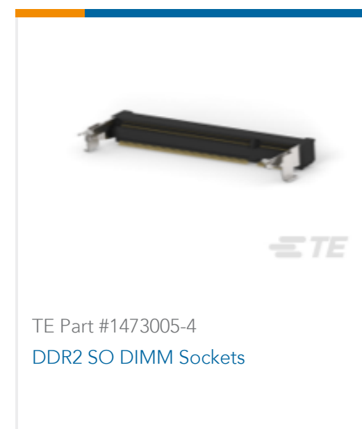
TE Part #1473005-4 DDR2 SO DIMM Sockets