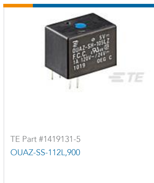
TE Part #1419131-5 OUAZ-SS-112L,900