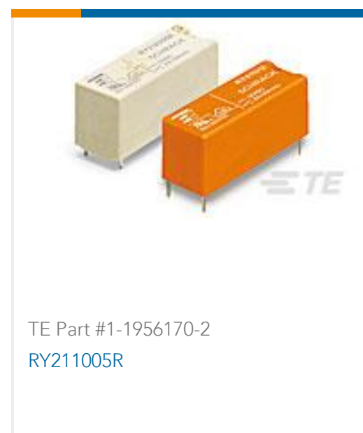
TE Part #1-1956170-2 RY211005R