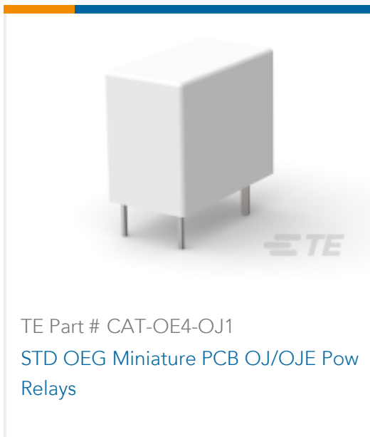
TE Part # CAT-OE4-OJ1 STD OEG Miniature PCB OJ/OJE Pow Relays