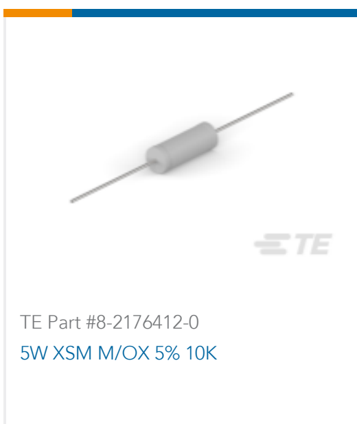
TE Part #8-2176412-0 5W XSM M/OX 5% 10K