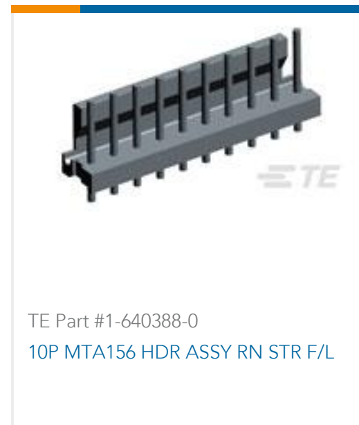
TE Part #1-640388-0 10P MTA156 HDR ASSY RN STR F/L