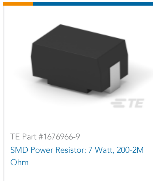
TE Part #1676966-9 SMD Power Resistor: 7 Watt, 200-2M Ohm