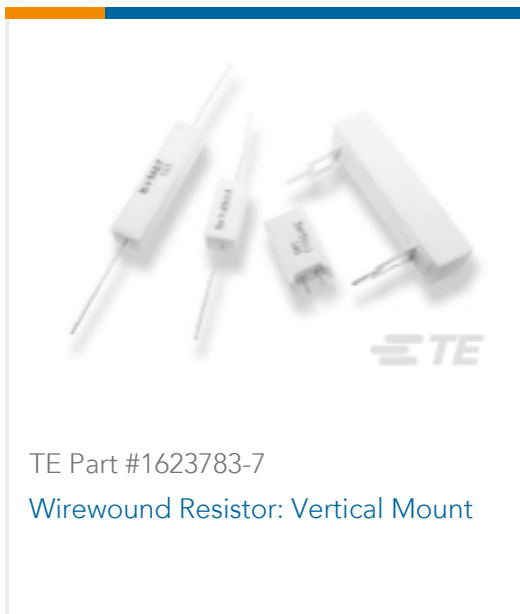
TE Part #1623783-7 Wirewound Resistor: Vertical Mount