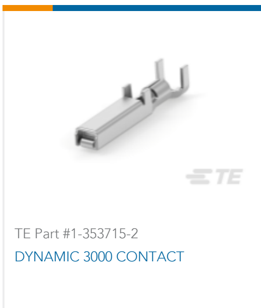
TE Part #1-353715-2 DYNAMIC 3000 CONTACT