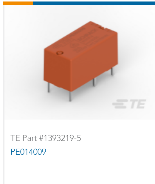
TE Part #1393219-5 PE014009