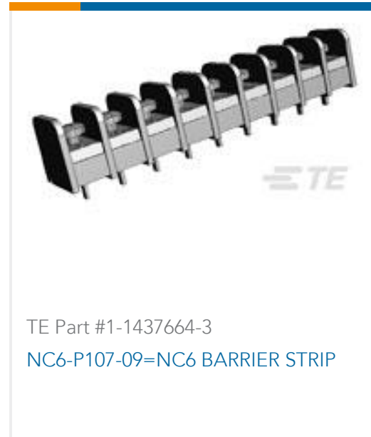
TE Part #1-1437664-3 NC6-P107-09=NC6 BARRIER STRIP