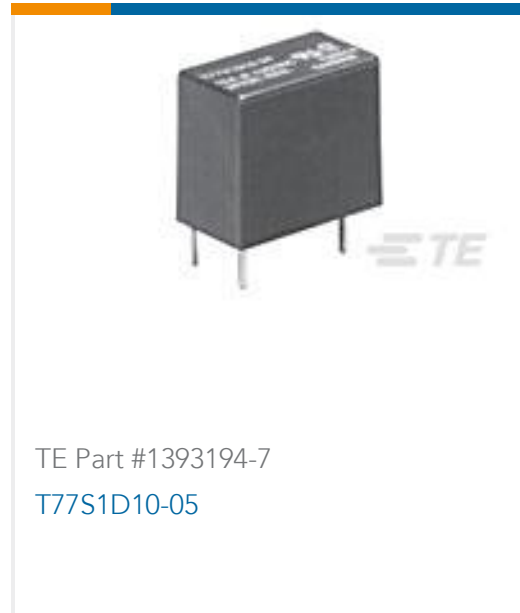
TE Part #1393194-7 T77S1D10-05