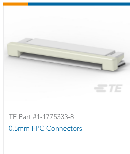
TE Part #1-1775333-8 0.5mm FPC Connectors