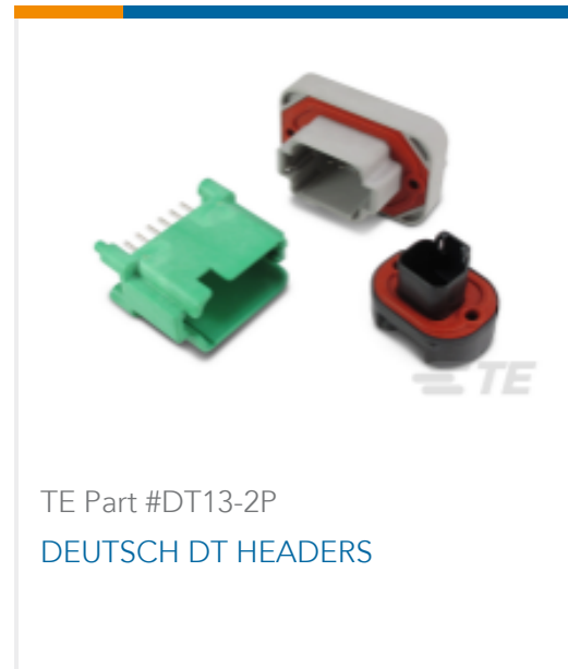
TE Part #DT13-2P DEUTSCH DT HEADERS