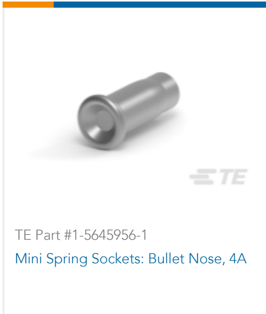
TE Part #1-5645956-1 Mini Spring Sockets: Bullet Nose, 4A