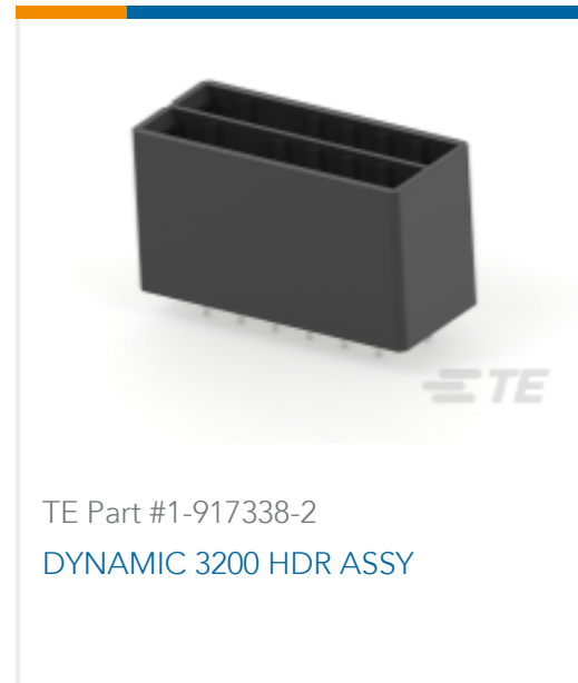
TE Part #1-917338-2 DYNAMIC 3200 HDR ASSY