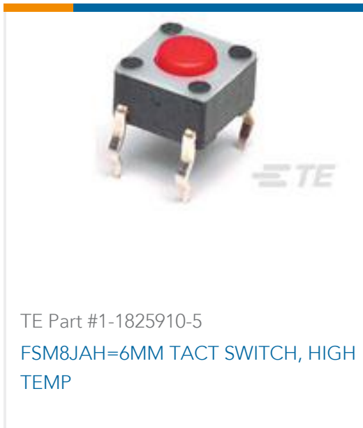
TE Part #1-1825910-5 FSM8JAH=6MM TACT SWITCH, HIGH TEMP