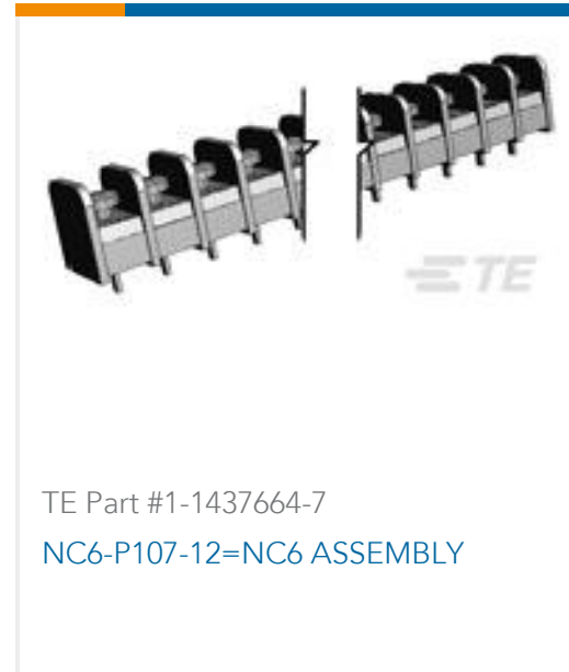
TE Part #1-1437664-7 NC6-P107-12=NC6 ASSEMBLY