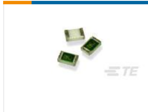
TE Part #1-1879417-7 CPF 0603 820K 0.1% 25PPM 1K RL