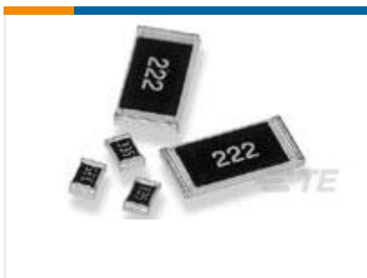
TE Part #1-2176186-5 CRGH1206 1% 1K8 0.5W