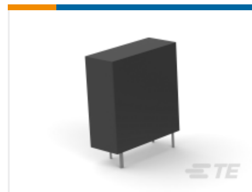
TE Part #1419126-5 STD OEG PCB PCFN Solar Power Relays