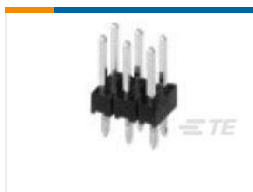
TE Part #104433-3 06 MODII HDR DRST B/A W/HD