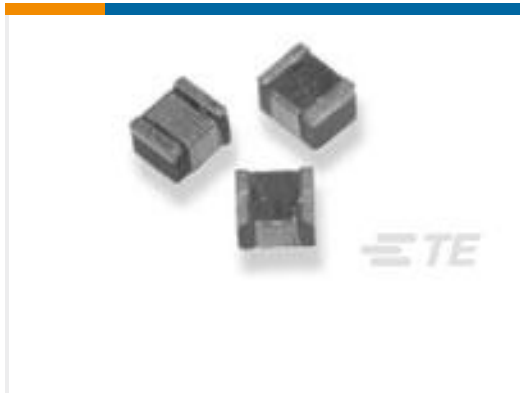
TE Part #1-1879023-1 3650 1008 47nH 5% 2K RL