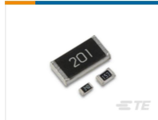
TE Part #1-2176326-4 CRGP 0603 120R 1%