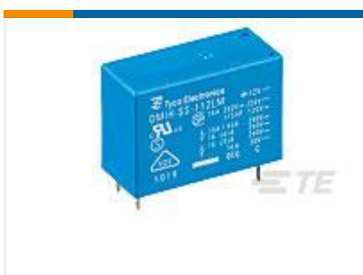
TE Part #1-1461387-9 OMIT-SH-124LM,394