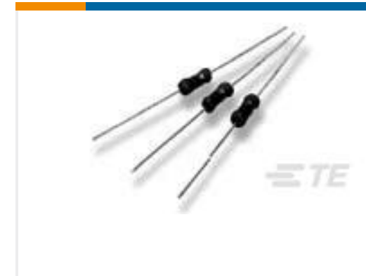
TE Part #9-1879350-3 RR01 5% 1K5 AMMO