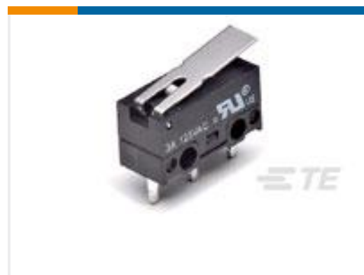
TE Part #1-1825043-6 UP3DTANLB04,MICROSWITCH,SNAP