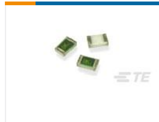
TE Part #9-1879028-2 RN 0805 475K 0.1% 10PPM 1K RL