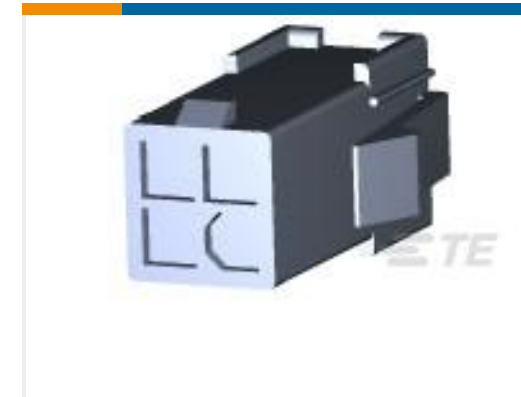
TE Part #1-172159-9 MINI UNIVERSAL M-N-L CAP 4P