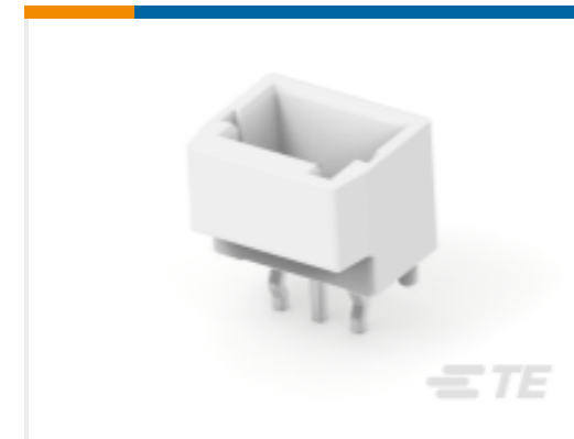
TE Part #1-2232826-3 SGI2.0 header assembly TH 3P,key A, NTL