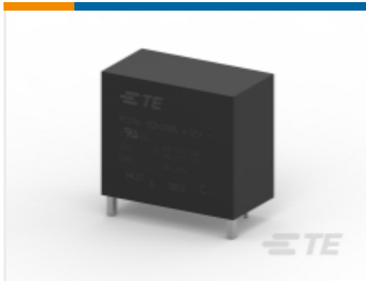
TE Part #1461353-2 PCFN SOLAR RELAY