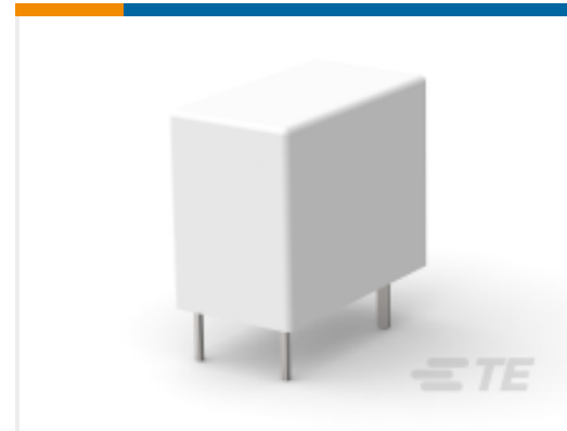
TE Part #1461400-1 STD OEG Miniature PCB OJ/OJE Pow Relays