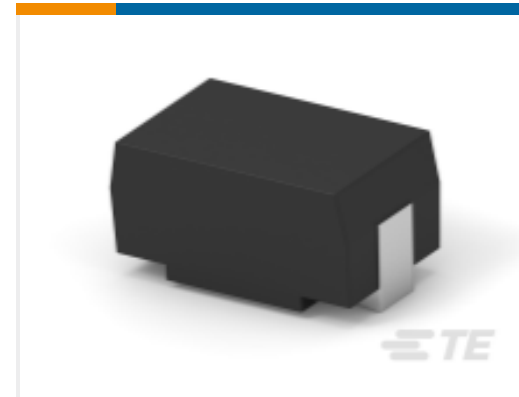
TE Part #1-1879234-5 SMD Power Resistor: 7 Watt, 200-2M Ohm