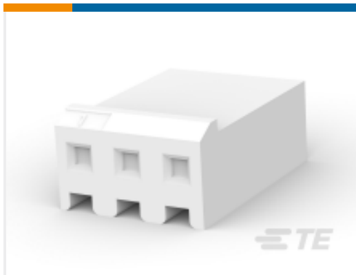
TE Part #1-647402-7 3.96mm Wire-to-board housing: receptacle, with mating alignment, SL 156