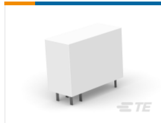
TE Part #1440002-5 STD SCHRACK RZF Power Relays