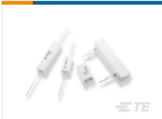
TE Part #1-1879068-0 Wirewound Resistor: Horizontal Mount