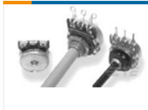
TE Part #1624157-2 23E 220KB 6.35X50FL B7 CAT