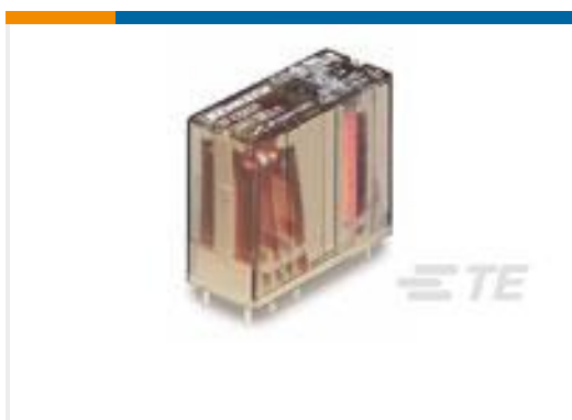
TE Part #1393845-5 RP821024