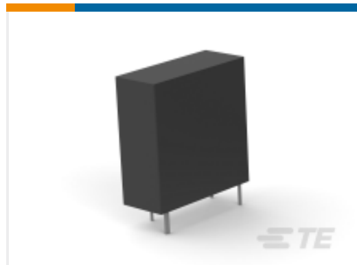
TE Part #1-1419126-8 STD OEG PCB PCFN Solar Power Relays