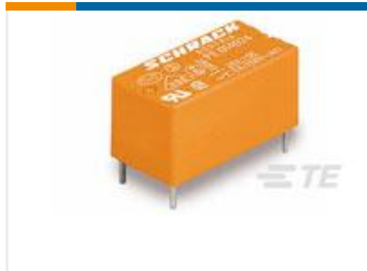
TE Part #1393219-6 PE014012