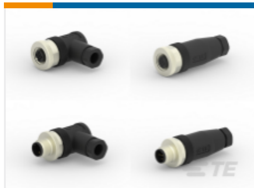
TE Part #T4110001051-000 M12 Field Installable Unshielded