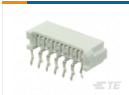
TE Part #1-84534-4 1.25mm FPC Connectors