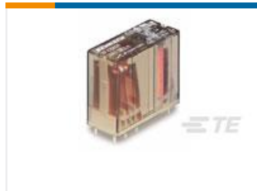
TE Part #1393845-4 RP821012