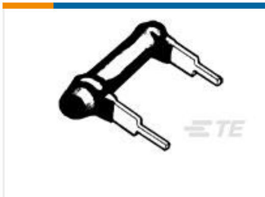
TE Part #1-1623714-2 FCB4 220R 5% HP