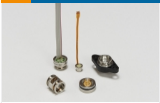
Media Isolated Pressure Sensors(52)