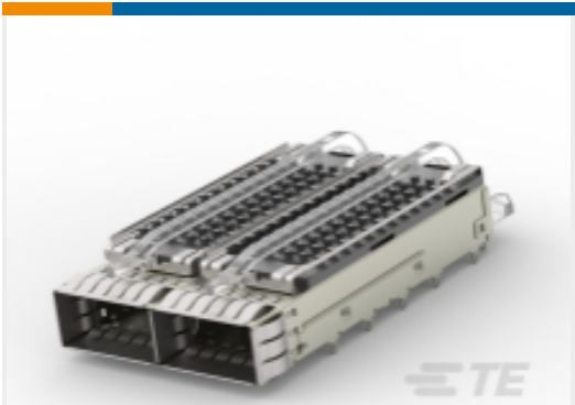
TE Part #2170808-1 QSFP28, 1X2, CAGE ASSY, SPRING, HS, LP