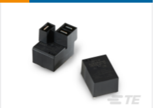
TE Part #1558662-4 PCB Power Relay: 30 amp, Monostable DC