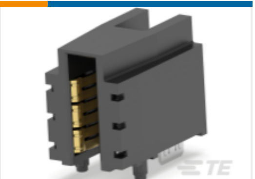
TE Part #2204018-2 CC 150 - CROWN CLIP Dual Power Connector