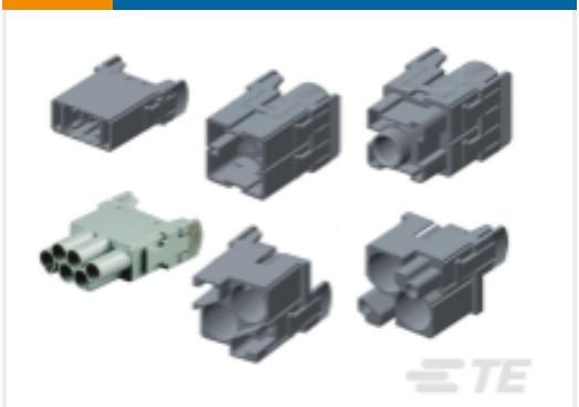
TE Part #T2111092201-007 HDC HMN - RAIL COMPLIANT MODULAR SYSTEM