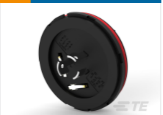
TE Part #1-2336396-1 ASSEMBLY, LIGHT CONTROLLER BASE, W/VENT