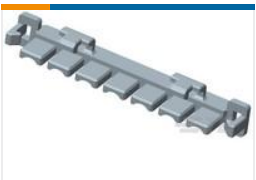
TE Part #1-1969609-2 12P VAL-U-LOK TPA 26-22 AWG