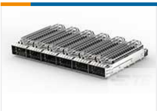
TE Part #2-2170708-1 CAGE ASSY, 1X6, QSFP28, SPRING, HS, LP