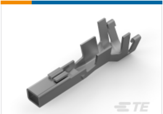
TE Part #177915-9 POWER DBL LOCK REC CONT