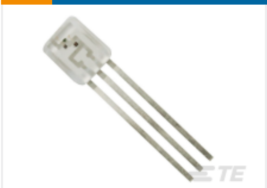
TE Part #11032254-00 PHOTO OPTIC EMITTER ASSEMBLY