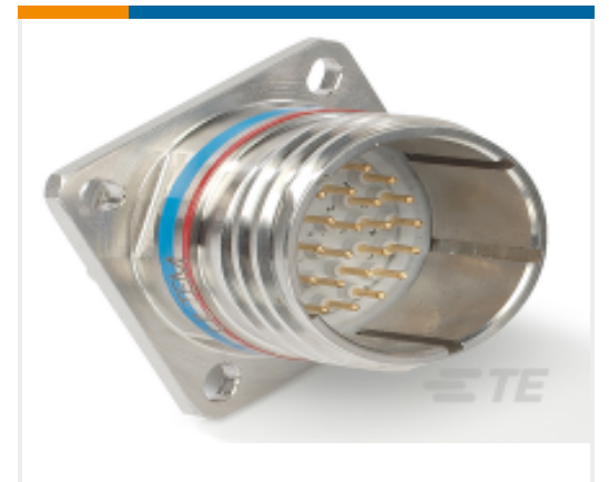
TE Part #YDTS20G13-35SBV001 D38999: Square Flange, 13-35 insert