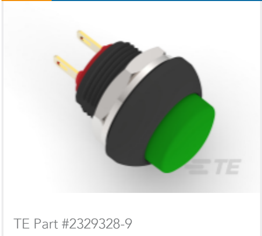
PB OFF/ON HC GRE M2 TERM. IP68