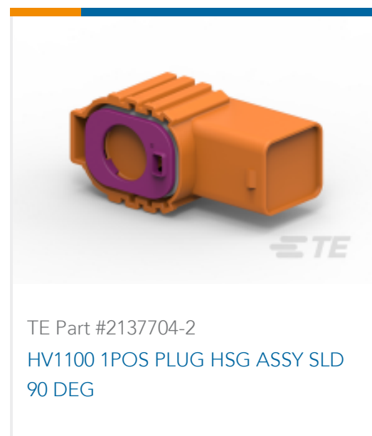
TE Part #2137704-2 HV1100 1POS PLUG HSG ASSY SLD 90 DEG