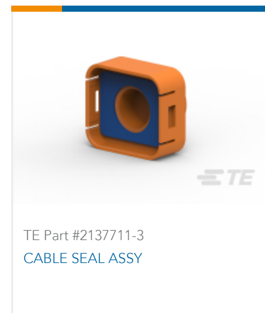
TE Part #2137711-3 CABLE SEAL ASSY