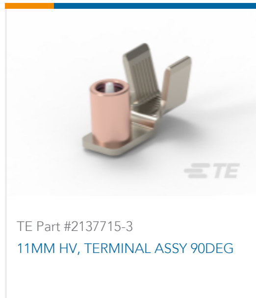
TE Part #2137715-3 11MM HV, TERMINAL ASSY 90DEG