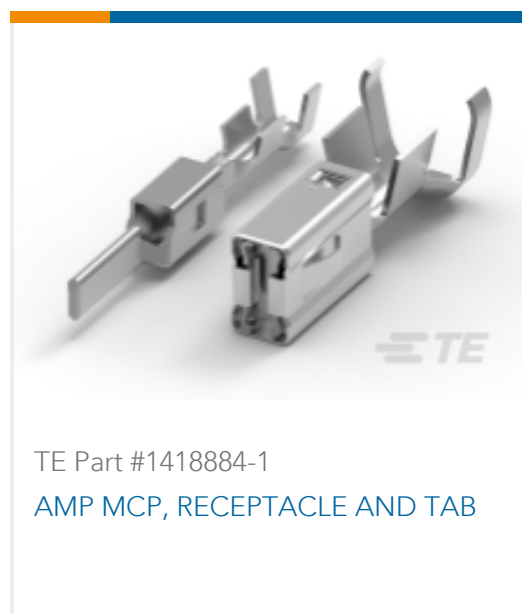
TE Part #1418884-1 AMP MCP, RECEPTACLE AND TAB