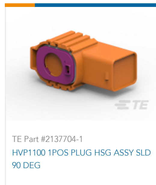
TE Part #2137704-1 HVP1100 1POS PLUG HSG ASSY SLD 90 DEG