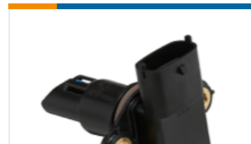
TE Part #HPP816E056 Digital RH Temperature Pressure Sensor