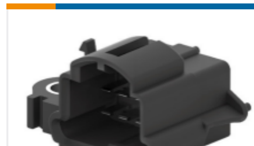
TE Part #1-1718093-1 LOW & MEDIUM POWER HEADER