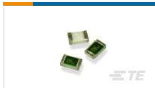
TE Part #1-2176217-6 CPF A 0805 68R 0.1% 25PPM 1K RL