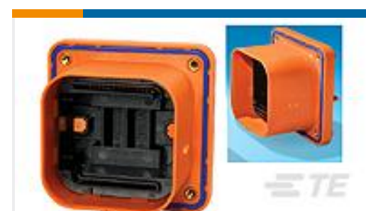
TE Part #1-1587987-1 RECEPTACLE ASSEMBLY, 350A, MSD