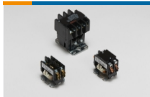
Definite Purpose Contactors(1)