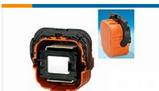
TE Part #1-2103212-1 Plug Assembly, 350A, MSD