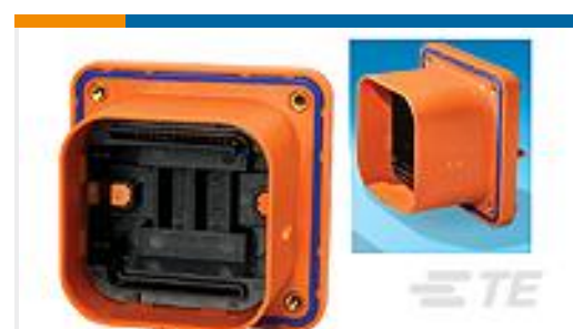
TE Part #1-1587987-7 RECEPTACLE ASSEMBLY, Shunt, MSD