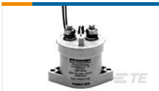
TE Part #1-1618002-5 EV200H1ANA=RELAY, SPST-NO WITH