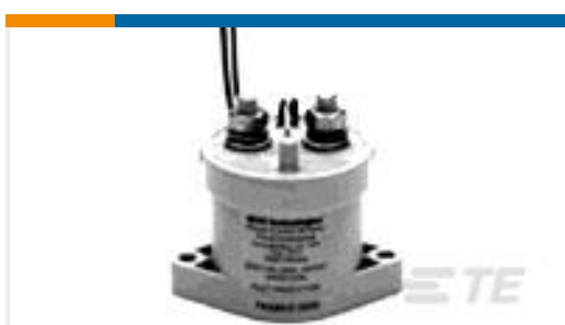
TE Part #1-1618002-1 EV200ADANA=RELAY, EV200 SPST-NO