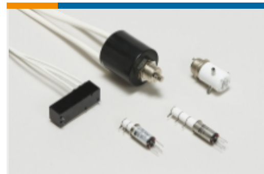
High Voltage Relays(17)