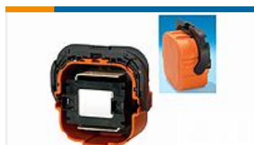
TE Part #1-2103172-7 Plug Assembly, Shunt, MSD