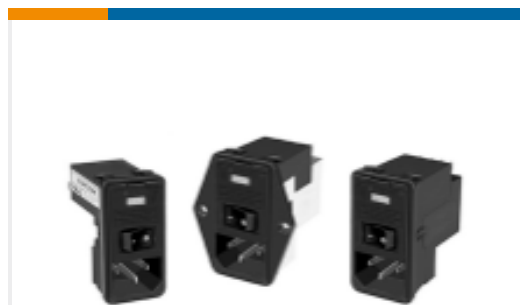
TE Part #1-6609951-7 CORCOM P SERIES MULTI-FUNCTION INLET FIL