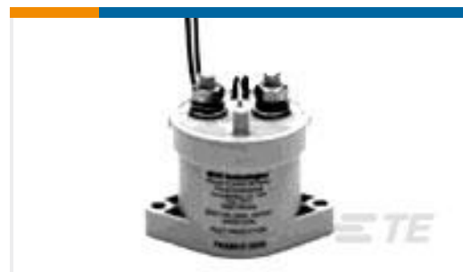
TE Part #1-1618002-1 EV200ADANA=RELAY, EV200 SPST-NO