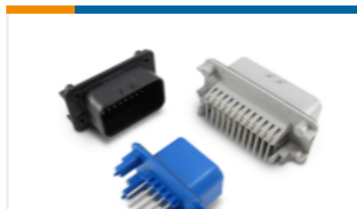
TE Part #1-776276-1 AMPSEAL HEADERS