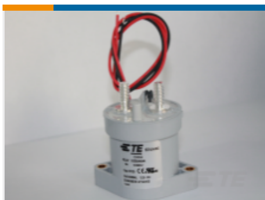
TE Part #1618002-4 EV200A3ANA=RELAY, EV200, SPST-NO