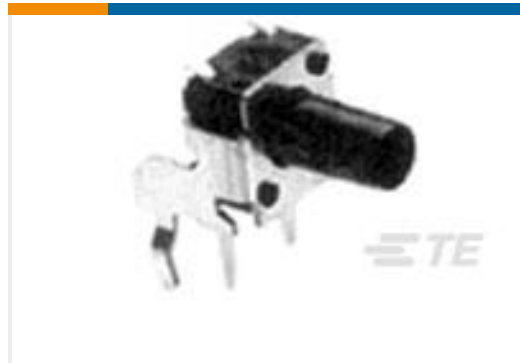
TE Part #1-1825027-4 FSMRA5JH04=R/A,TACT PB SW,160G