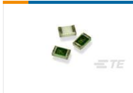
TE Part #1614881-8 CPF0603 15K 0.1% 25PPM 1K RL