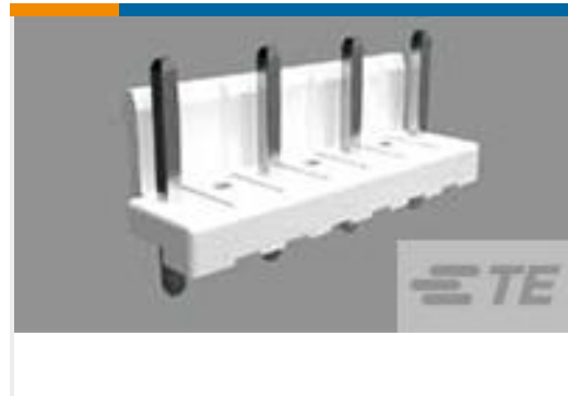
TE Part #1-1123724-4 3.96EP HDR ASSY 4(7)P NATURAL