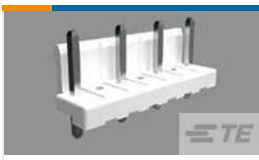
TE Part #1-1123724-3 3.96EP HDR ASSY 3(5)P NATURAL