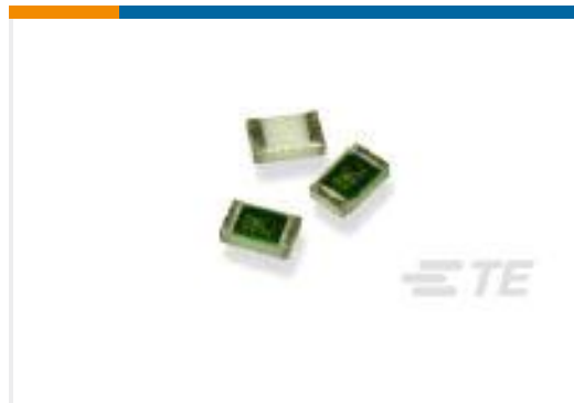
TE Part #1-2176215-8 CPF A 0402 3K3 0.1% 25PPM 1K RL