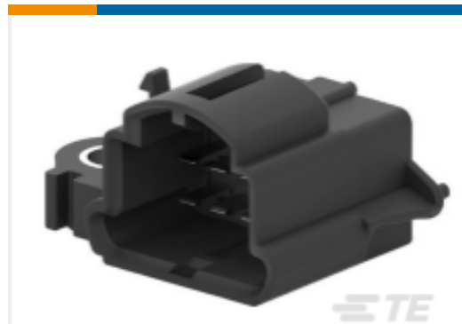
TE Part #1-2141227-1 LOW & MEDIUM POWER HEADER