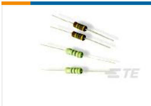
TE Part #1623720-2 CCR2 10K 10%