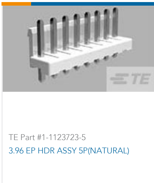
TE Part #1-1123723-5 3.96 EP HDR ASSY 5P(NATURAL)