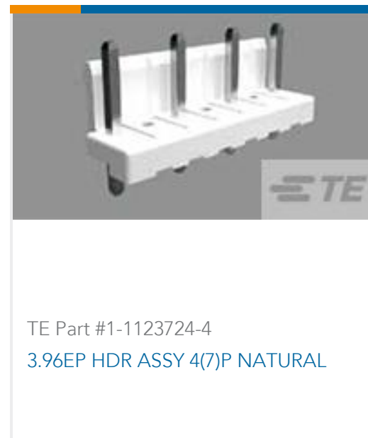
TE Part #1-1123724-4 3.96EP HDR ASSY 4(7)P NATURAL