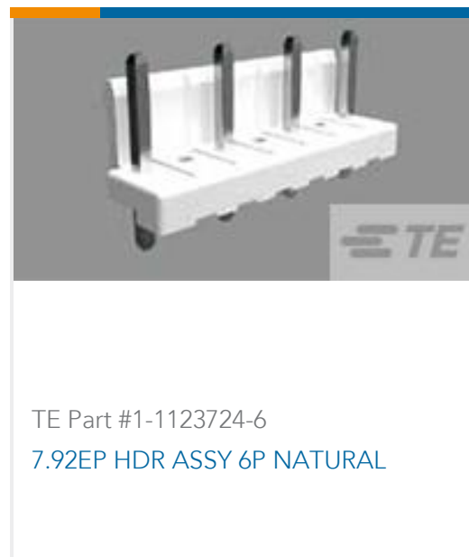
TE Part #1-1123724-6 7.92EP HDR ASSY 6P NATURAL