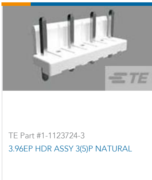
TE Part #1-1123724-3 3.96EP HDR ASSY 3(5)P NATURAL