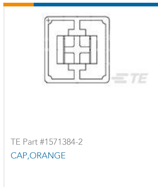
TE Part #1571384-2 CAP,ORANGE