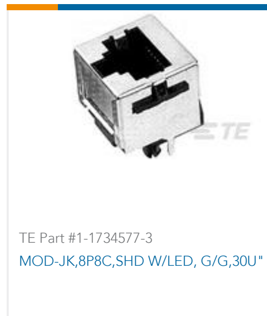
TE Part #1-1734577-3 MOD-JK,8P8C,SHD W/LED, G/G,30U"