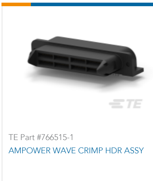
TE Part #766515-1 AMP POWER WAVE CRIMP HDR ASSY