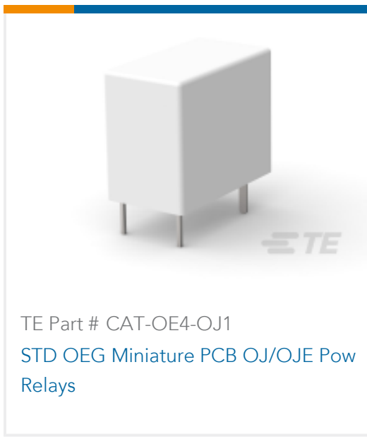
TE Part # CAT-OE4-OJ1 STD OEG Miniature PCB OJ/OJE Pow Relays