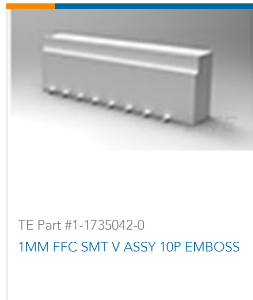
TE Part #1-1735042-0 1MM FFC SMT V ASSY 10P EMBOSS