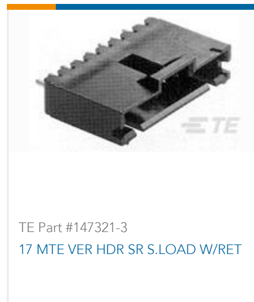
TE Part #147321-3 17 MTE VER HDR SR S.LOAD W/RET