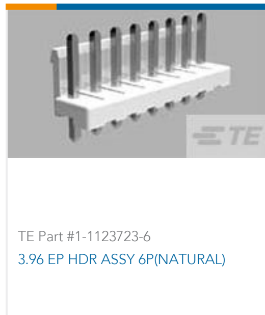
TE Part #1-1123723-6 3.96 EP HDR ASSY 6P(NATURAL)