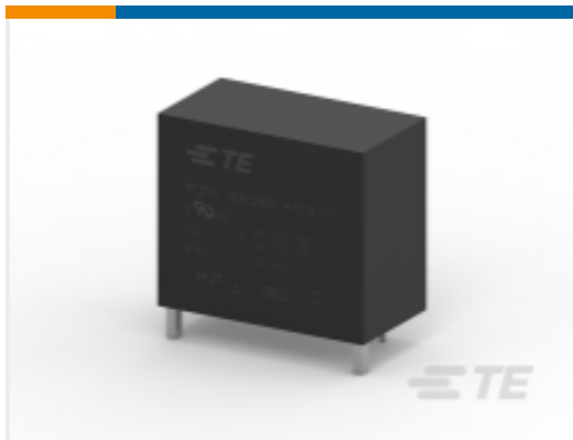
TE Part #1721766-5 PCFN SOLAR RELAY