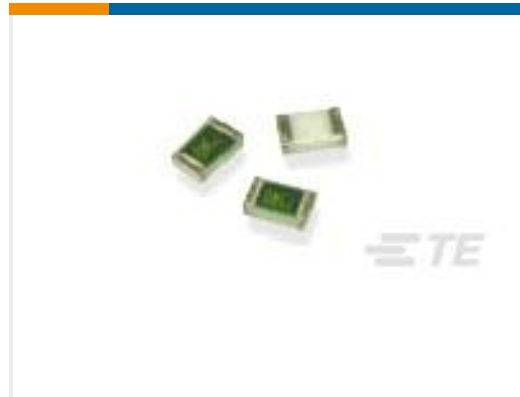
TE Part #1879015-4 RN 1206 20R5 0.1% 5PPM 5K RL