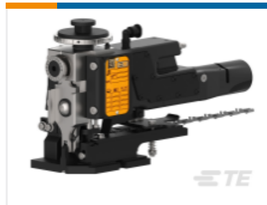
TE Part #2150815-2 OC-AT-E-FA-102F138F-040-0840