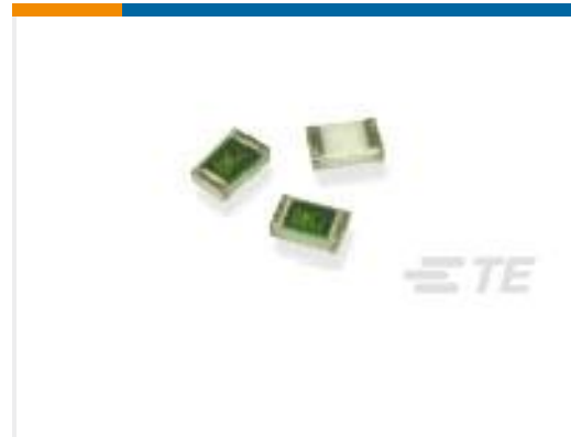
TE Part #2-1614707-9 RN 1206 10R2 0.1% 10PPM 1K RL