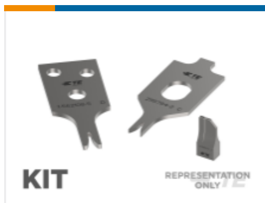
TE Part #7-2266452-7 OC-070F100F-CRIMP TOOLING KIT