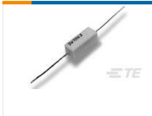
TE Part #1630880-4 FSQ5 R47 5%