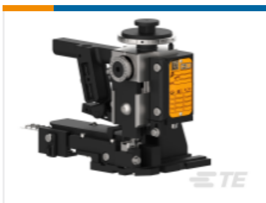
TE Part #2266452-1 OC-AT-S-FM-070F100F-139-0434