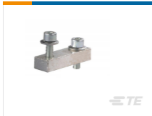
TE Part #1SNK922305R0000 JB22-5