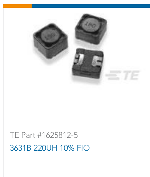
TE Part #1625812-5 3631B 220UH 10% FIO