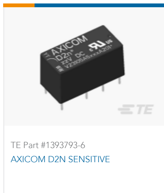
TE Part #1393793-6 AXICOM D2N SENSITIVE