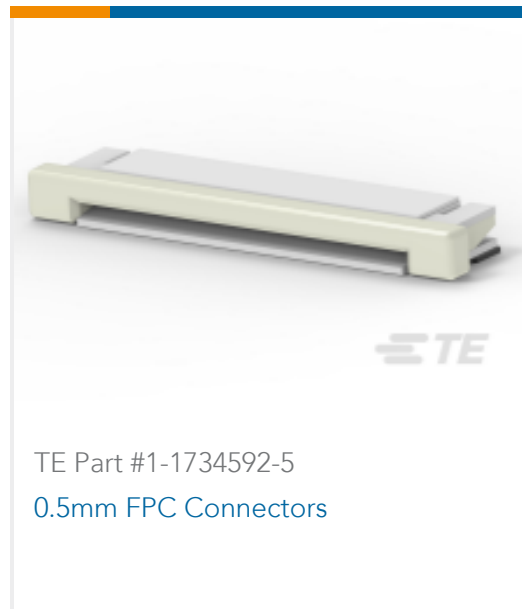
TE Part #1-1734592-5 0.5mm FPC Connectors