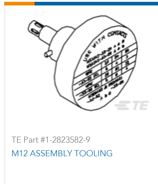
TE Part #1-2823582-9 M12 ASSEMBLY TOOLING