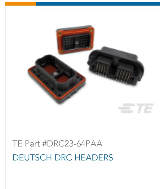
TE Part #DRC23-64PAA DEUTSCH DRC HEADERS