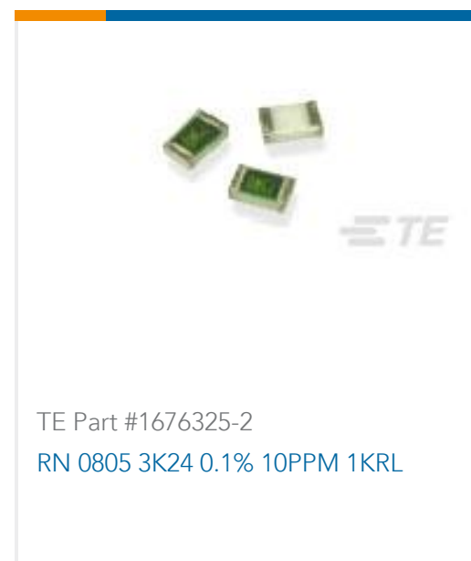
TE Part #1676325-2 RN 0805 3K24 0.1% 10PPM 1KRL