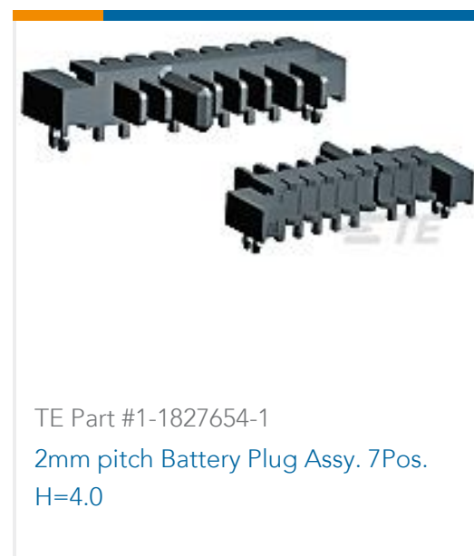
TE Part #1-1827654-1 2mm pitch Battery Plug Assy. 7Pos. H=4.0