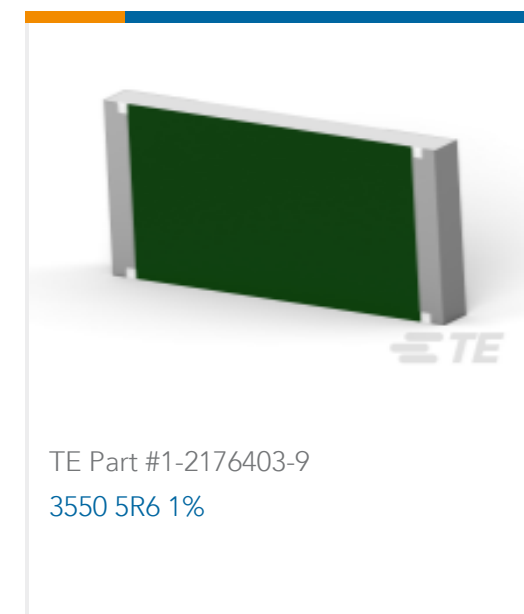
TE Part #1-2176403-9 3550 5R6 1%