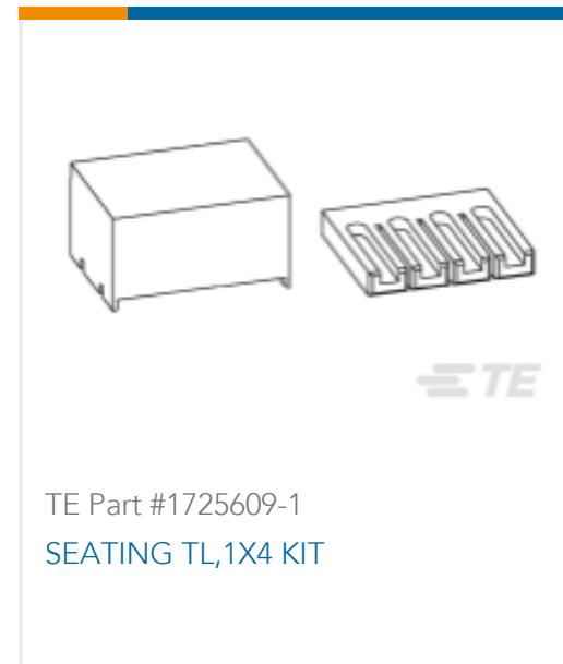
TE Part #1725609-1 SEATING TL, 1X4 KIT