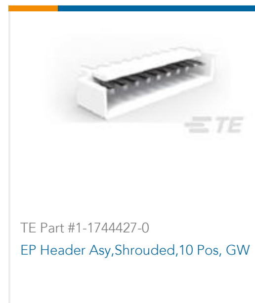
TE Part #1-1744427-0 EP Header Asy, Shrouded, 10 Pos, GW