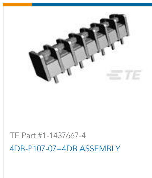
TE Part #1-1437667-4 4DB-P107-07=4DB ASSEMBLY