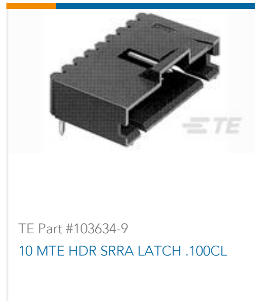
TE Part #103634-9 10 MTE HDR SRRRA LATCH .100CL