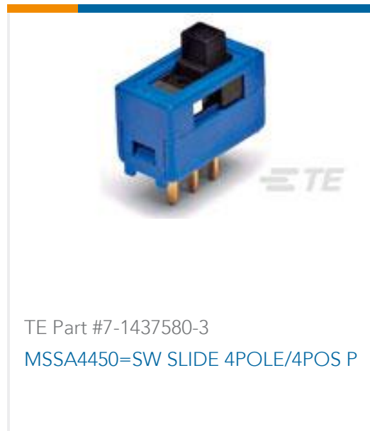
TE Part #7-1437580-3 MSSA4450=SW SLIDE 4POLE/4POS P