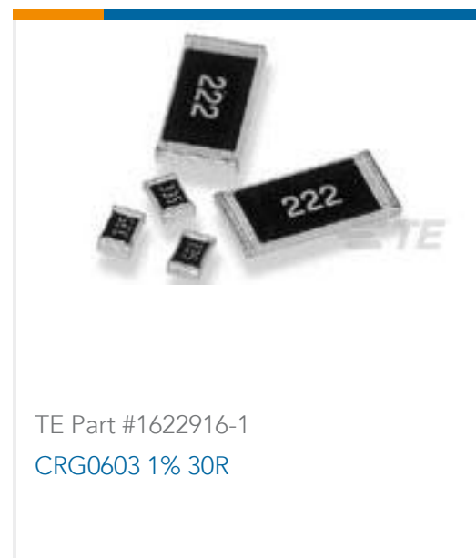
TE Part #1622916-1 CRG0603 1% 30R