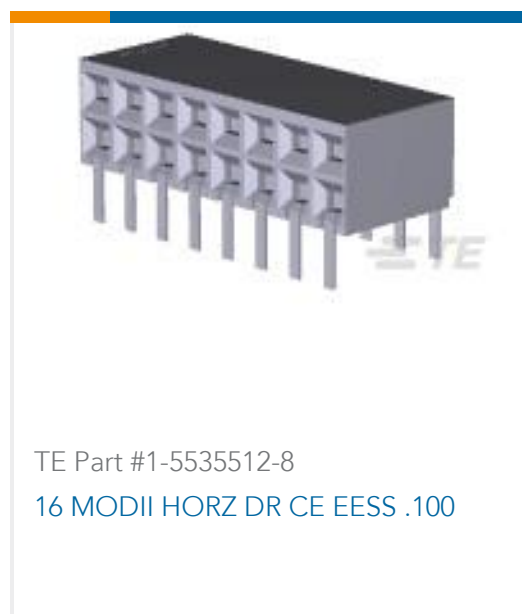
TE Part #1-5535512-8 16 MODII HORZ DR CE EESS .100