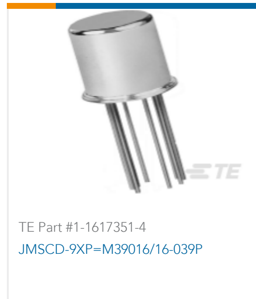
TE Part #1-1617351-4 JMSCD-9XP=M39016/16-039P