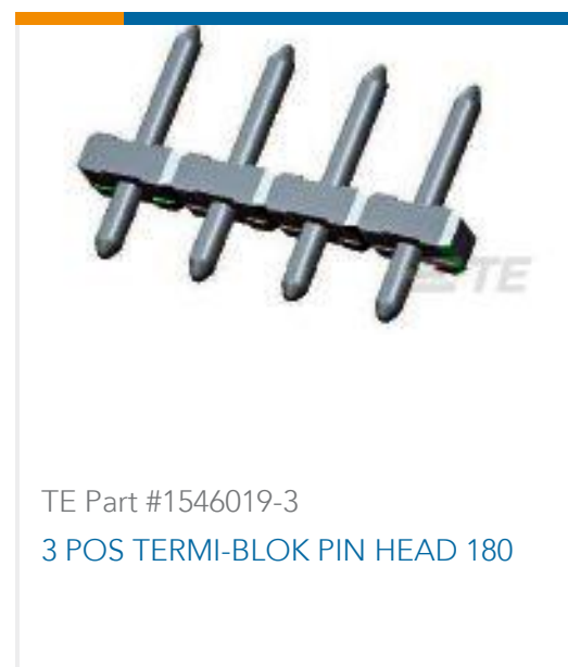
TE Part #1546019-3 3 POS TERMI-BLOK PIN HEAD 180