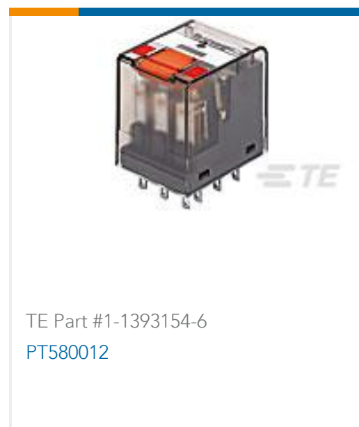
TE Part #1-1393154-6 PT580012