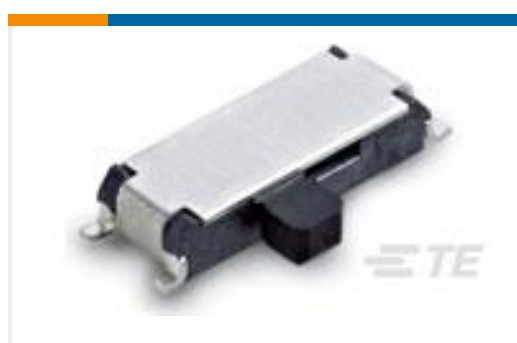
TE Part #1437575-1 MLL1200S=SPDT RA SMT SLIDE