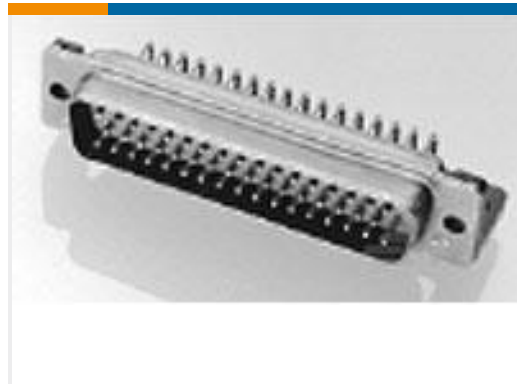
TE Part #1218440-2 AMPLIMITE,ASY,PLUG,RT ANG,109,2