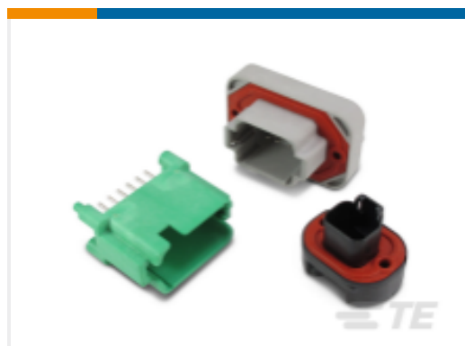
TE Part #DTF13-2P DEUTSCH DT HEADERS