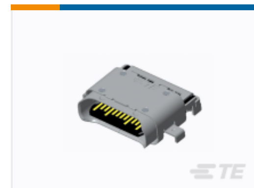
TE Part #1-2295018-2 USB TYPE C, REC OFFSET 0.65MM DUAL SMT