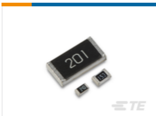
TE Part #1-2176326-3 CRGP 0603 100R 1%