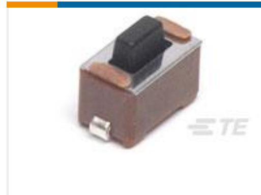
TE Part #147873-1 SWITCH,TACT,SMT,J-LEAD,5.0MM