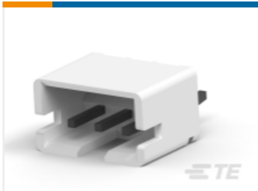
TE Part #1775469-2 AMP HPI 2.0MM HEADERS