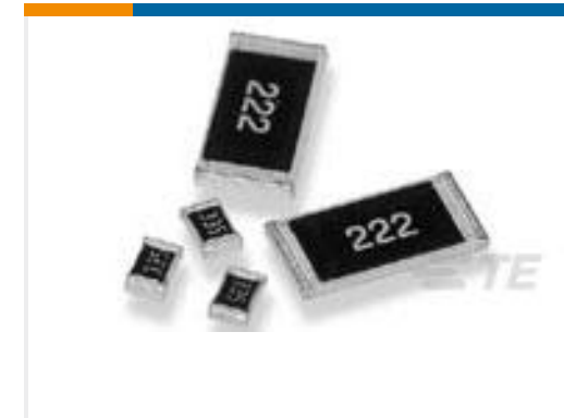
TE Part #1622829-2 CRG0603 1% 10K 10K RL