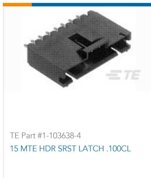
TE Part #1-103638-4 15 MTE HDR SRST LATCH .100CL