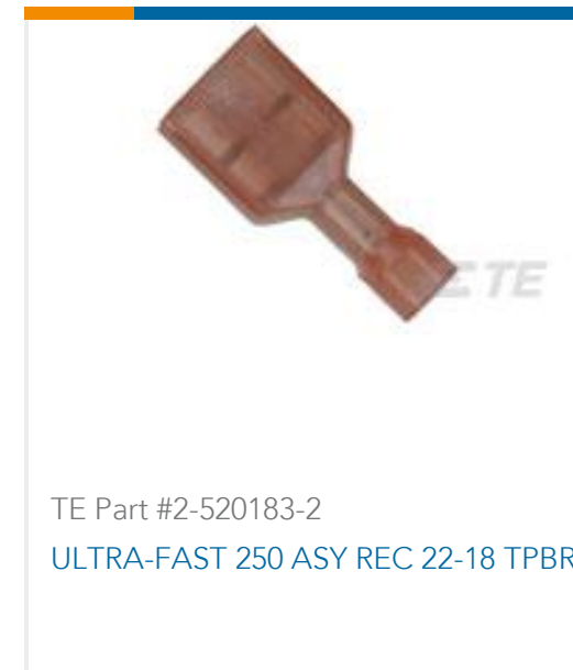
TE Part #2-520183-2 ULTRA-FAST 250 ASY REC 22-18 TPBR