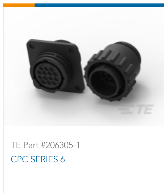
TE Part #206305-1 CPC SERIES 6