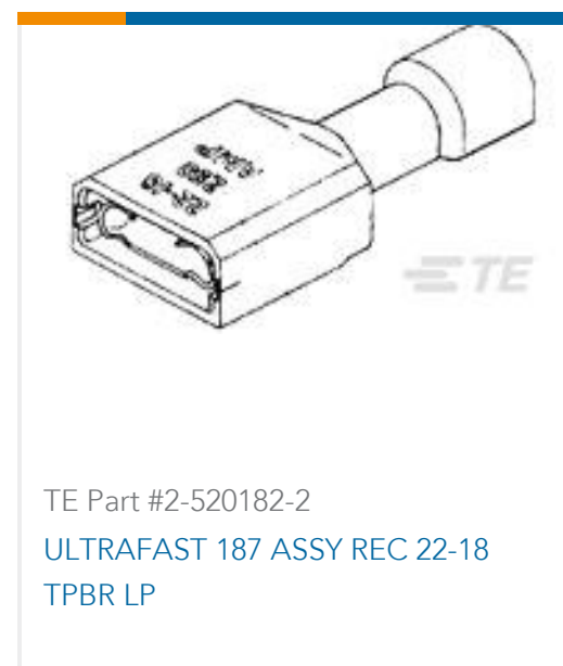
TE Part #2-520182-2 ULTRAFAST 187 ASSY REC 22-18 TPBR LP