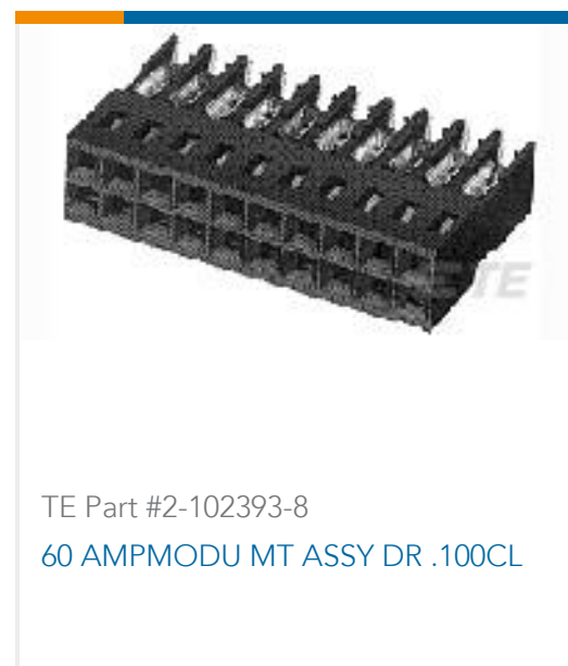
TE Part #2-102393-8 60 AMPMODU MT ASSY DR .100CL