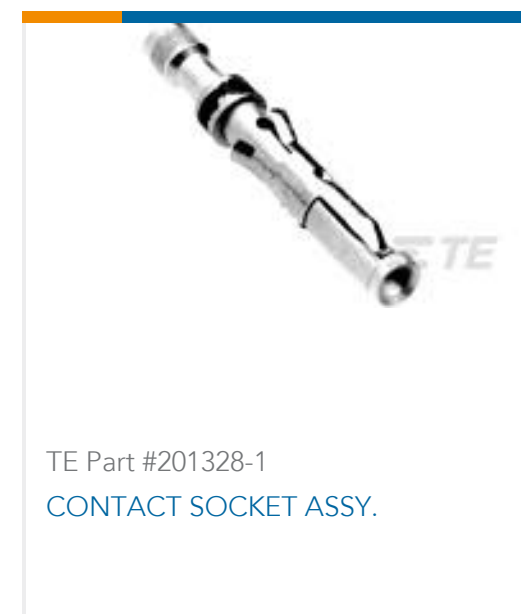
TE Part #201328-1 CONTACT SOCKET ASSY.