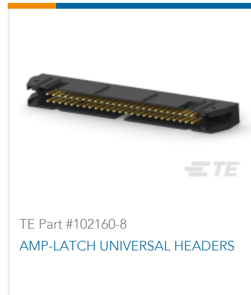
TE Part #102160-8 AMP-LATCH UNIVERSAL HEADERS