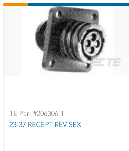
TE Part #206306-1 23-37 RECEPT REV SEX