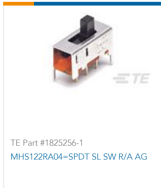
TE Part #1825256-1 MHS122RA04=SPDT SL SW R/A AG