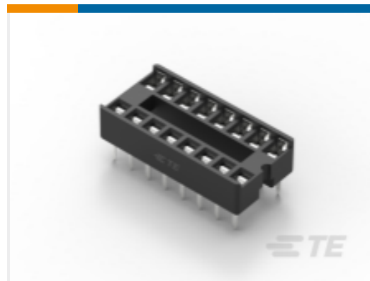
TE Part #1-2199298-6 DIP Socket: Low Profile, Stamped & Formed, Open, Tin