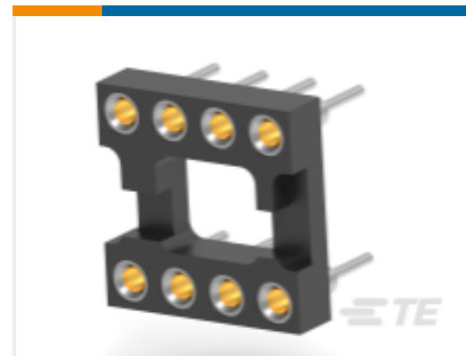
TE Part #1-2199300-2 DIP Socket: Standard, Stamped & Formed, Open, Tin