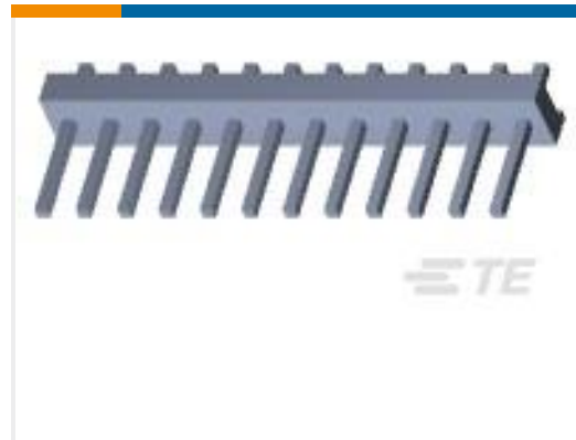
TE Part #1-640383-2 12P MTA156 HDR ASSY STR SQ SN