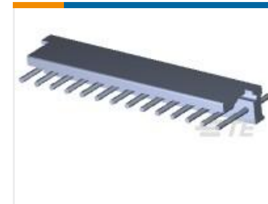
TE Part #1-644753-4 14P MTA156 HDR ASSY RN STR F/L