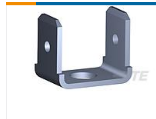
TE Part #141878-2 250 FASTON, TAB, TPBR