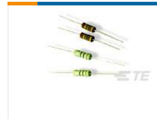
TE Part #1625875-5 CBT 1/4 5% 100R