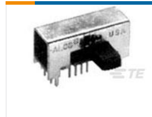
TE Part #1825203-2 MSSA3350RG04=SW SLIDE, 3P3T AU R /A