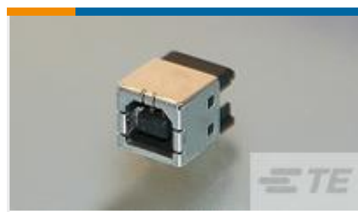
TE Part #1-1734346-1 STD USB TYPE B, R/A, SMT