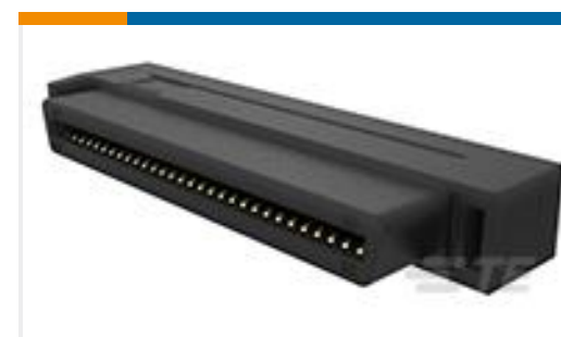
TE Part #1-1734099-2 Champ 050 series, plug assembly