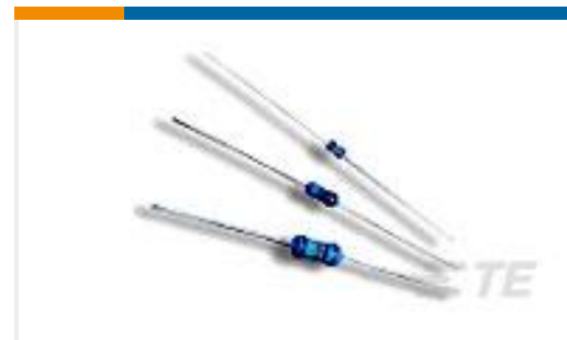
TE Part #1-1676914-7 YR1 0.1% 3K48