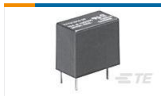
TE Part #1393194-9 T77S1D10-12