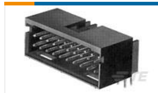
TE Part #103166-6 16 MODII HDR DRRA SHRD .100CL