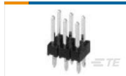
TE Part #104350-3 06 MODII HDR DRST B/A W/HD