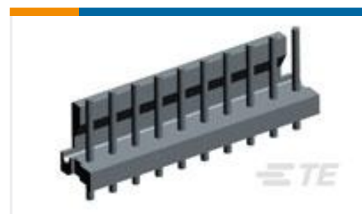
TE Part #1-640388-0 10P MTA156 HDR ASSY RN STR F/L