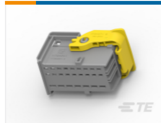
TE Part #1-1718484-4 AMP MCP BACKSHELLS