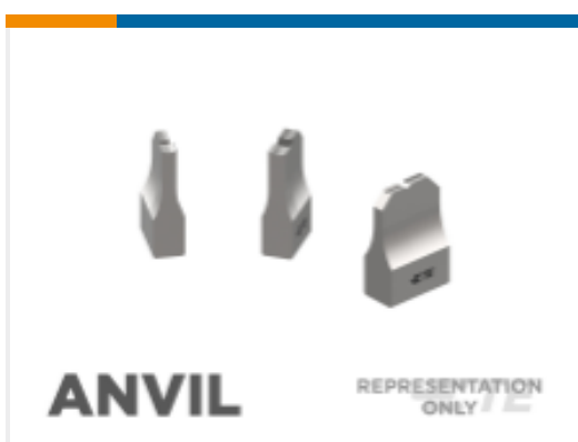
TE Part #1-1633928-7 ANVIL COMBINATION