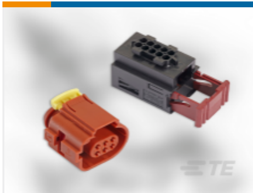
TE Part #1-929504-2 TIMER, CONNECTOR HOUSING