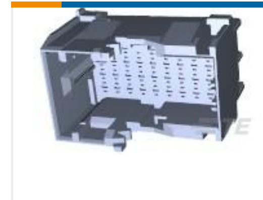
TE Part #1-1718492-3 1.5MM TAB HSG 36 POS ASSY