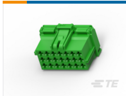
TE Part #1-2112890-1 AMP MCP, UNSEALED CONNECTOR HOUSING