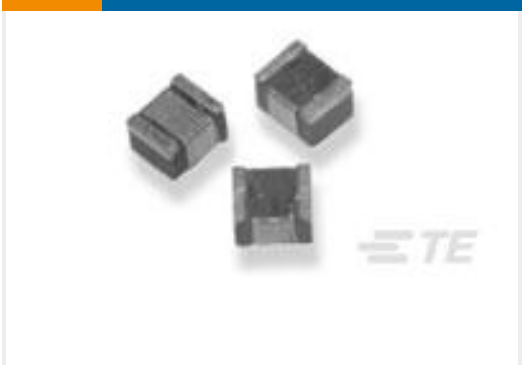
TE Part #1879023-4 3650 1008 15nH 5% 2K RL