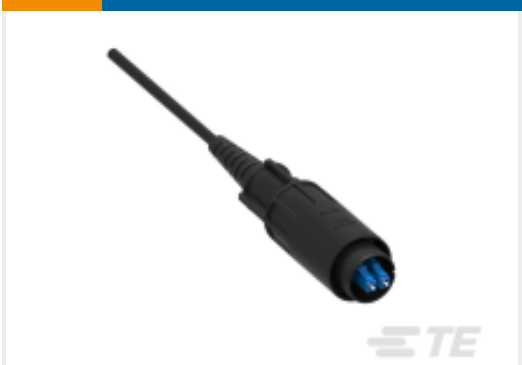
TE Part #1-2061980-0 FOSM GLARO LEAD 4.8 MM FXS MINI 10M