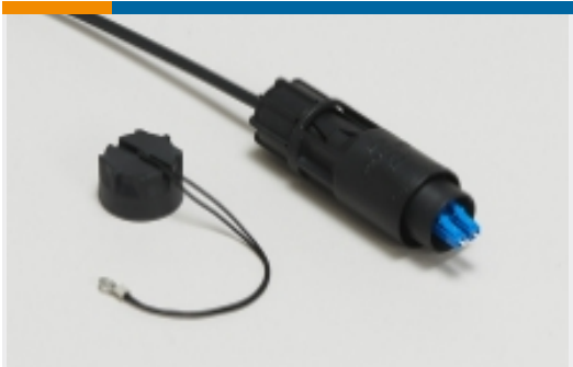
Rugged Fiber Cable Assemblies(20)