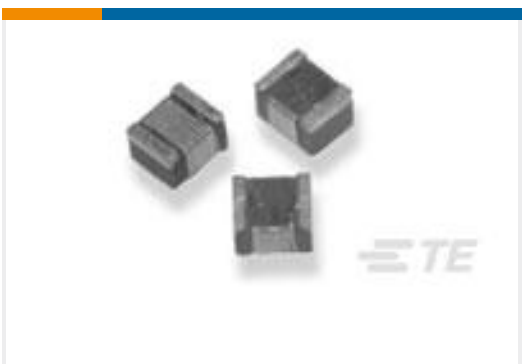
TE Part #1879023-7 3650 1008 24nH 5% 2K RL