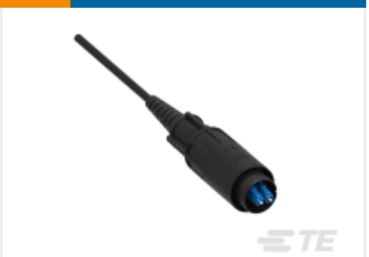
TE Part #2-2061980-0 FOSM GLARO LEAD 4.8 MM FXS MINI 20M