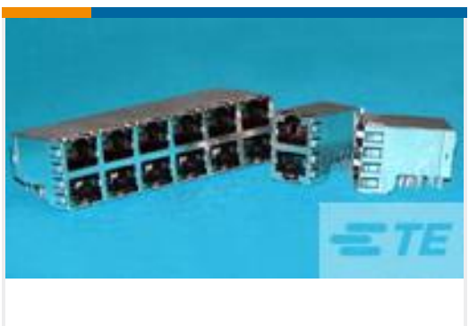
TE Part #1888654-3 2X8 OFFSET STACK JK