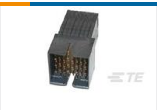
TE Part #1934349-1 TinMan R/A Header Assy 5x8 Open