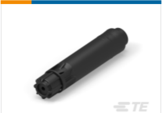
TE Part #2061973-1 FULLPROOF140 MINI FIELD INSTALL KIT