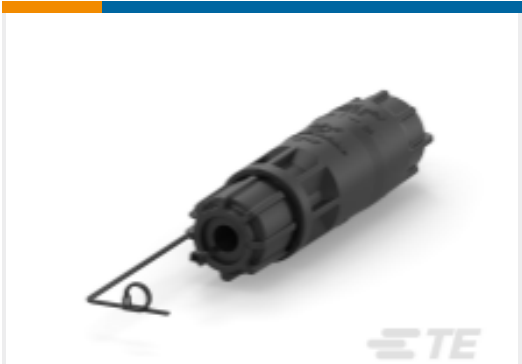
TE Part #2061933-1 FULLPOWER MINI FIELD INSTALL ASSEMBLY