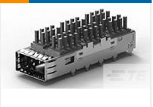
TE Part #2170450-1 Cage Assy W/Hsink, Thru Bezel,