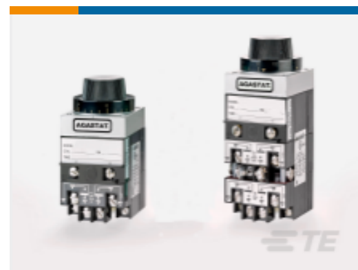
TE Part # 2-1472973-2 7012RCA2I=RLY,STD,ON,2P,60VDC, 15SEC,A2,I