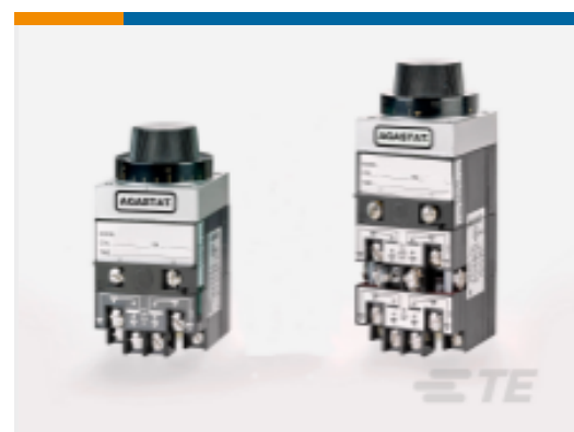
TE Part # 1423159-5 7012NE=RLY,STD,ON,2P,48VDC,200