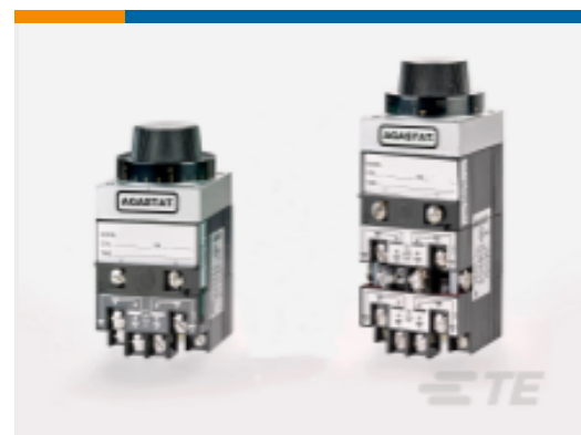
TE Part # 1423161-8 7014PD=RLY,STD,ON,4P,125VDC,10