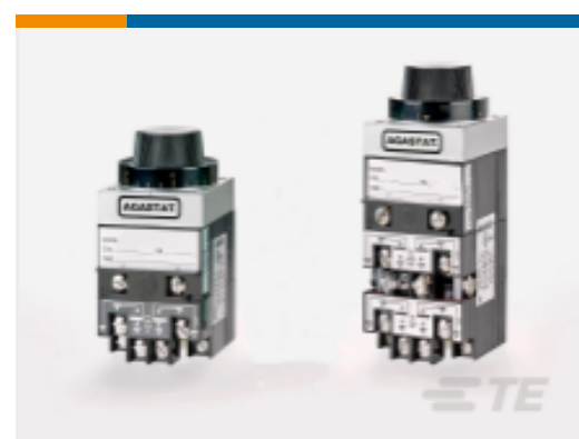
TE Part # 5-1437456-4 7022OFV=24V DC 1-10 MINS