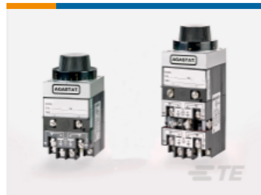
TE Part # 4-1423164-1 7022RCM=RLY,STD,OFF,2P,60VDC,