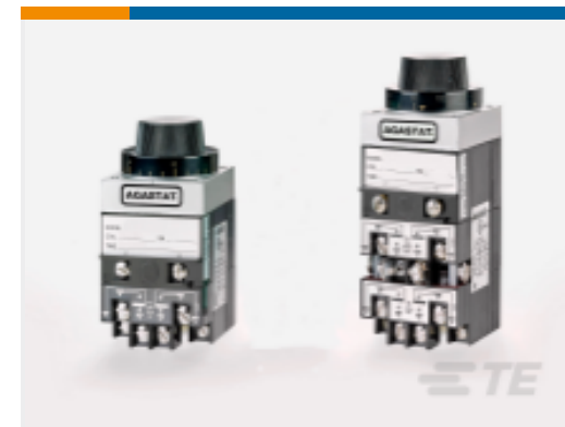
TE Part # 1-1423166-4 7024PE=RLY,STD,OFF,4P,125VDC,E