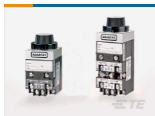
TE Part # 2-1755142-9 7022ODIMT=RLY,STD,OFF,2P,24V,50S, I,M,T