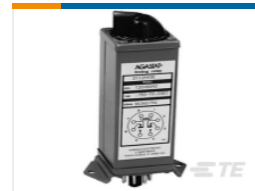
TE Part # 2-1423154-4 2122DH39YD=RLY,MINI,OFF,2P,125V, 3SEC