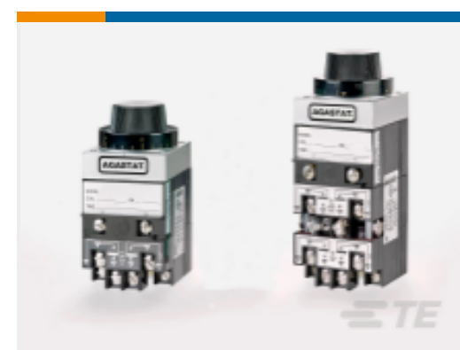
TE Part # 6-1423162-2 7022CF=RLY,STD,OFF,2P,480VAC, 10MIN