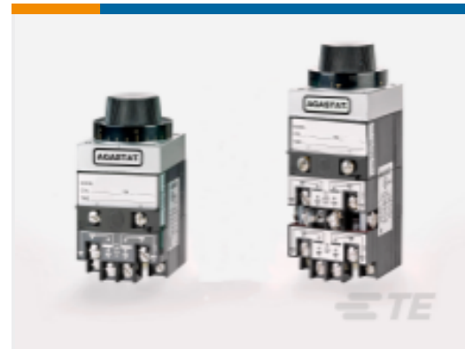
TE Part # 1423162-5 7022AC=RLY,STD,OFF,2P,120VAC,1