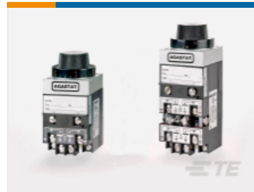
TE Part # 3-1423159-3 7012PJ=RLY,STD,ON,2P,125VDC,1