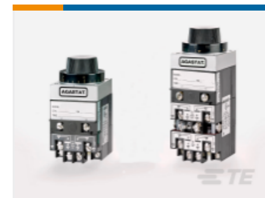
TE Part # 1-1423157-3 7012AEL=RLY,STD,ON,2P,120VAC,2