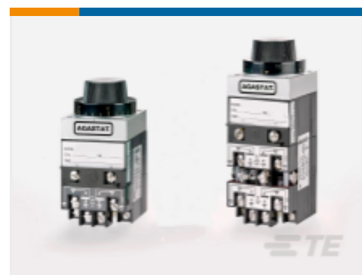
TE Part # 1423159-8 7012NJ=RLY,STD,ON,2P,48VDC,12