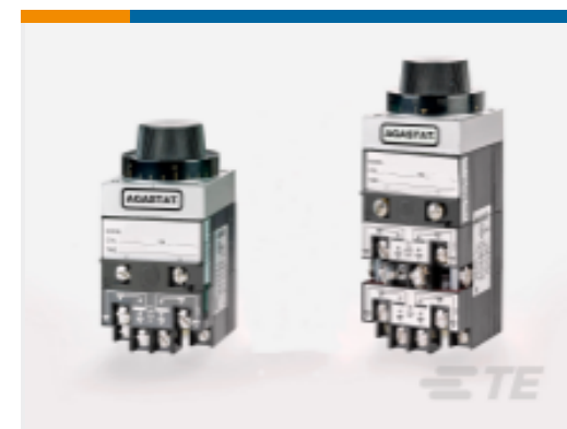
TE Part # 1423164-3 7022NB=RLY,STD,OFF,2P,48VDC,5