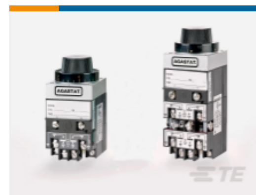
TE Part # 6-1423159-9 7012PDX=RLY,STD,ON,2P,125VDC,