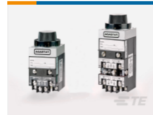
TE Part # 3-1423159-9 7012PK=RLY,STD,ON,2P,125VDC 30