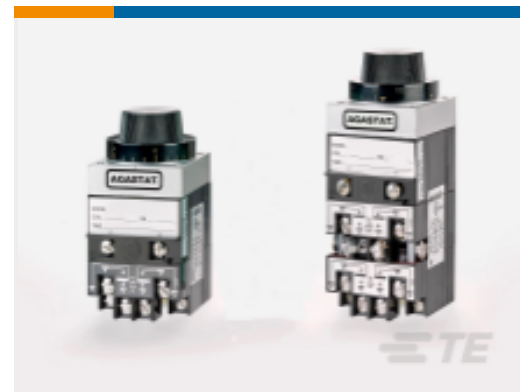
TE Part # 1-1423160-6 7014CD=RLY,STD,4P,480VAC,100SEC