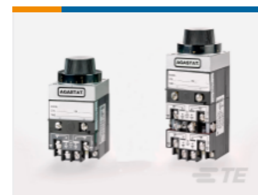
TE Part # 6-1755142-7 7022X16HA2=RLY,STD,OFF,2P,21V, 30M,A2