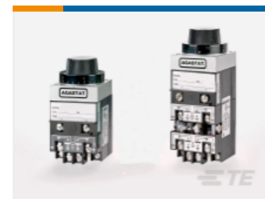
TE Part # 1423164-8 7022OB=RLY,STD,OFF,2P,24VDC,5