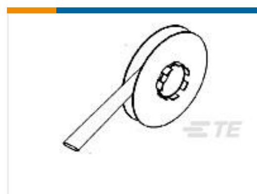
TE Part #CM6262-000 TTMS-MP-6.4-9