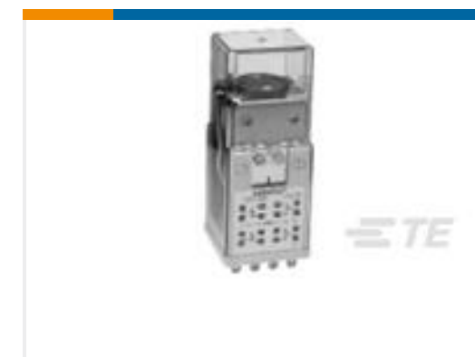
TE Part #1423155-4 GPCN=RELAY, 48VDC W/BLOWOUT DE