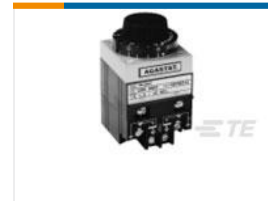
TE Part #1423161-4 7014PA=RLY,STD,ON,4P,125VDC,