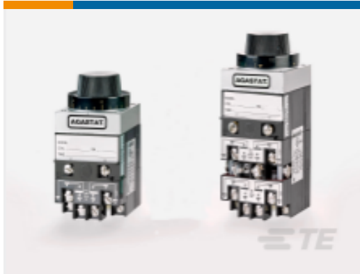
TE Part # 1423157-5 7012AC=RLY,STD,ON,2P,120VAC,15