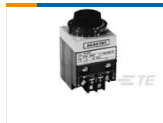
TE Part #1-1423157-5 7012AF=RLY,STD,ON,2P,120VAC,10