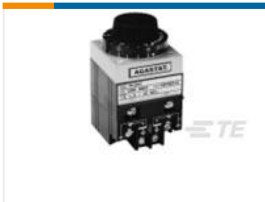
TE Part #1-1423159-7 7012PA=RLY,STD,ON,2P,125VDC,1