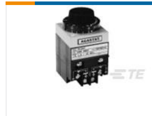
TE Part #1-1423159-9 7012PB=RLY,STD,ON,2P,125VDC, 5