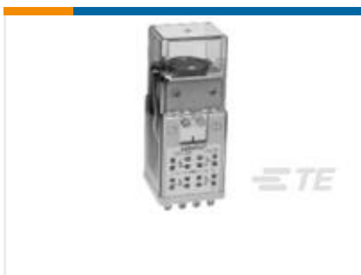
TE Part #1423155-5 GPD=RELAY, 125VDC