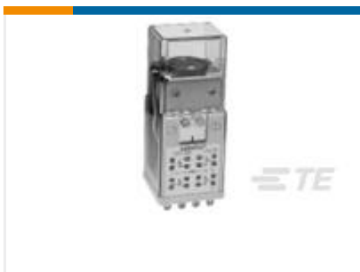
TE Part #1423156-4 GPIN=RLY, 120VAC, BOD