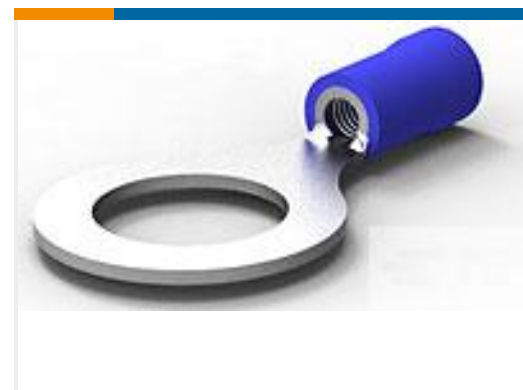
TE Part #160136 TERM, RING, PLASTI-GRIP, 16-14, M10