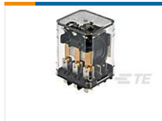
TE Part #1-1393117-9 KUP-11A15-120=KU