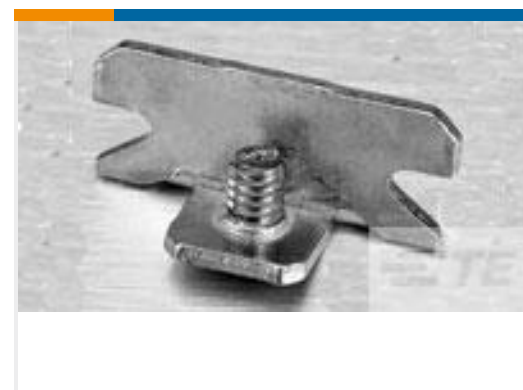
TE Part #9-1437381-5 61=CHANNEL CLAMP