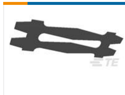
TE Part #192004-8 BAND STRIP LA1A(.006)SIL