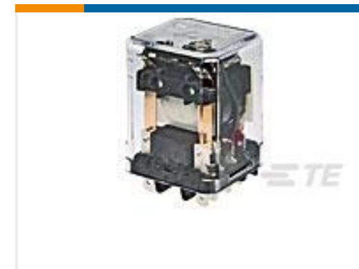
TE Part #1-1393114-2 KUEP-7D15-48=KU