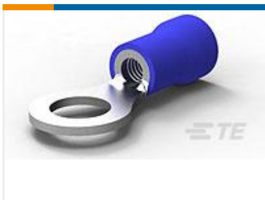
TE Part #130102 TERMINAL PLAS-GRP RNG-TNG 5MM