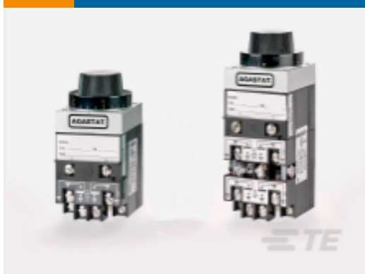
TE Part # 1-1423159-9 7012PB=RLY,STD,ON,2P,125VDC, 5