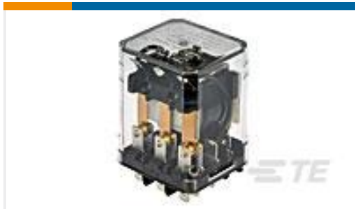
TE Part #3-1393118-1 KUP-14D45-110=KU