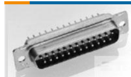
TE Part #1757833-2 AMPLIMITE,PLUG ASY,POSTD,109,ZN, 2