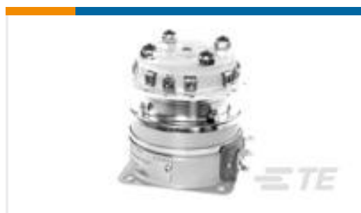
TE Part #5-1393139-8 MDR-5035=MDR