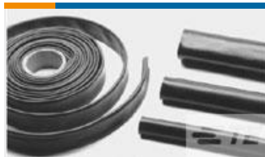
TE Part #CB5443-000 XFFR-20X4