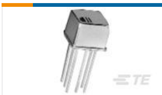
TE Part #1617145-1 JMGAC-12M = M39016/17-034M