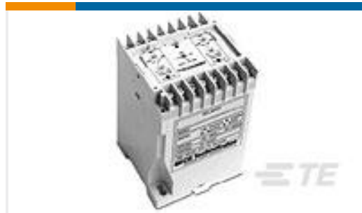
TE Part #1-1618058-2 WD2759-003=OVER /UNDervoltage R