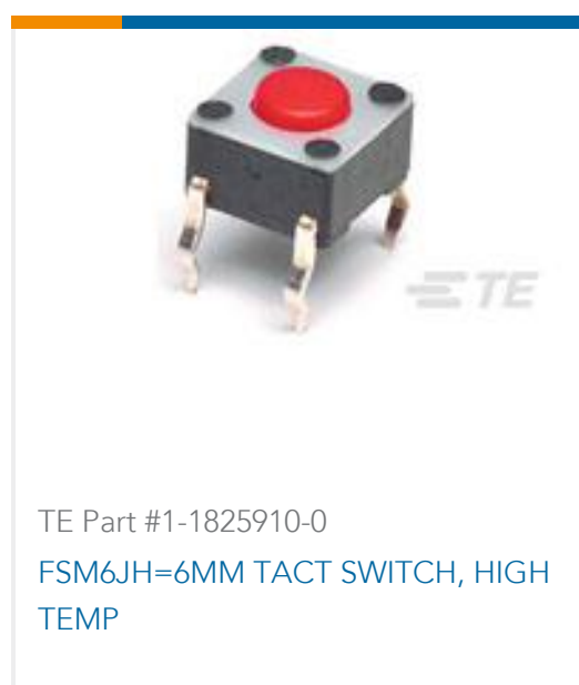
TE Part #1-1825910-0 FSM6JH=6MM TACT SWITCH, HIGH TEMP