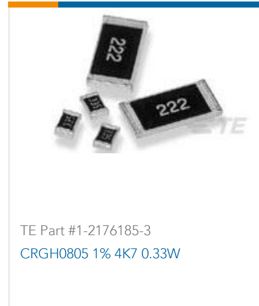
TE Part #1-2176185-3 CRGH0805 1% 4K7 0.33W