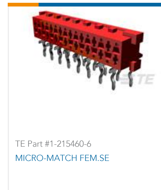
TE Part #1-215460-6 MICRO-MATCH FEM.SE