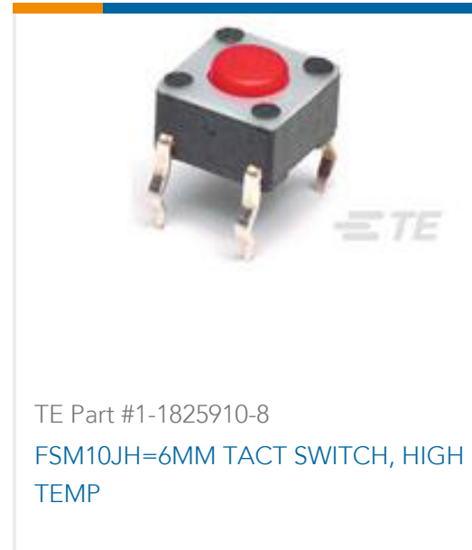
TE Part #1-1825910-8 FSM10JH=6MM TACT SWITCH, HIGH TEMP