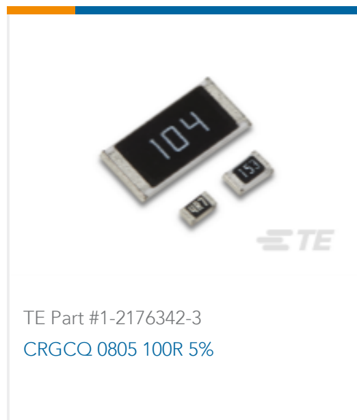
TE Part #1-2176342-3 CRGCO 0805 100R 5%