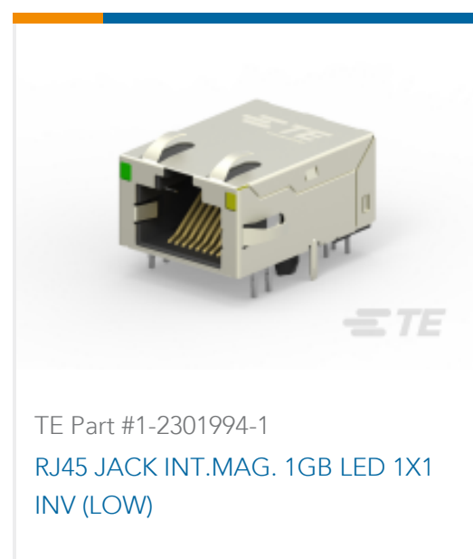
TE Part #1-2301994-1 RJ45 JACK INT.MAG. 1GB LED 1X1 INV (LOW)