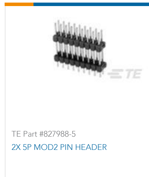
TE Part #827988-5 2X 5P MOD2 PIN HEADER