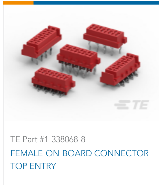
TE Part #1-338068-8 FEMALE-ON-BOARD CONNECTOR TOP ENTRY