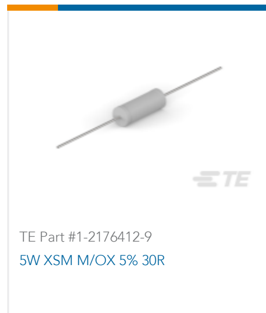
TE Part #1-2176412-9 5W XSM M/OX 5% 30R