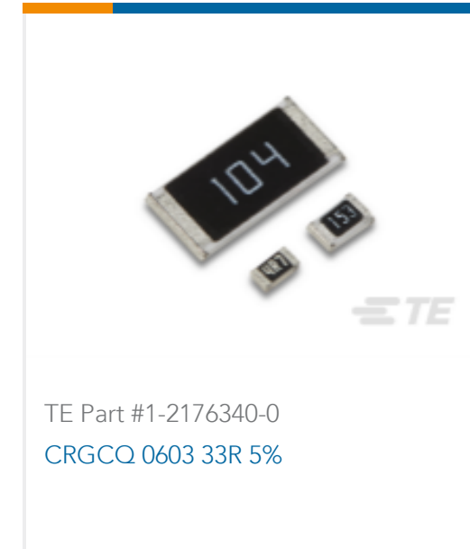
TE Part #1-2176340-0 CRGCO 0603 33R 5%