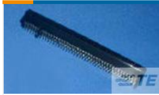
TE Part #1-1734774-6 PCI EXP 3.1L 164 POS BLK 15u"