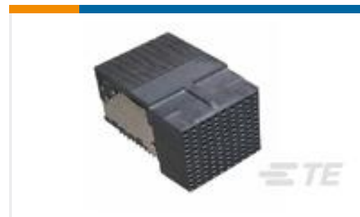
TE Part #1934224-1 Tin Man Recept Assy 4 pair 10 Column