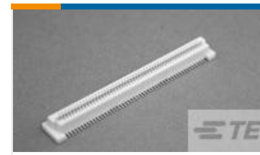
TE Part #1735681-5 0.8FH, R13H.5, 120, 15/Sn, TR, SC