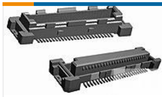
TE Part #1-5316318-0 .6FHR12H, 140, S, GIG, 08/Sn, HT, SEYes