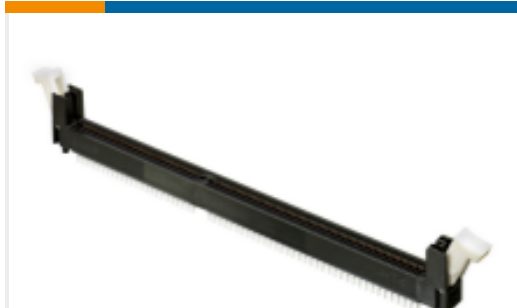
TE Part #1-1932680-1 DDR3 DIMM SOCKETS