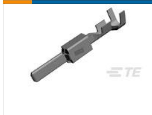
TE Part #1-965982-1 TAB TAB 0.2-0.5 MM2 0.32X35.0 PTPPHBZ