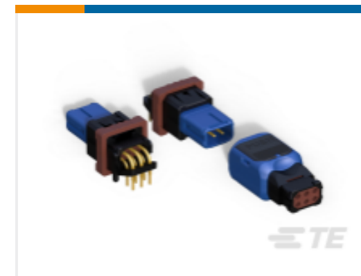
TE Part #YD369-B99-NP100000 369 9 WAY PANEL MOUNT REC, CRIMP, PIN