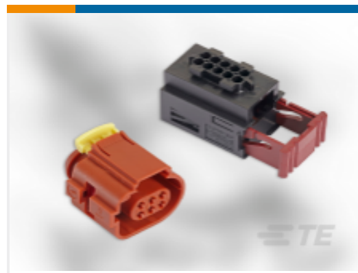
TE Part #1-967622-5 TIMER, CONNECTOR HOUSING