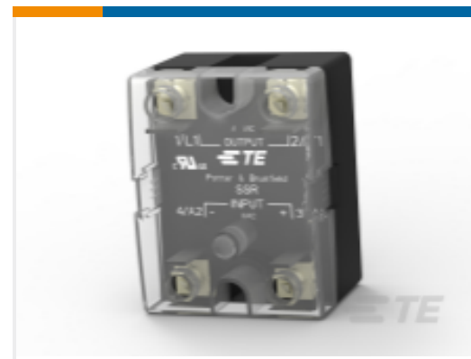
TE Part #1393030-7 P&B SSR SERIES SOLID STATE RELAYS