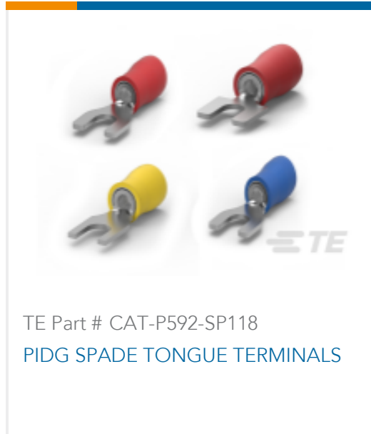
TE Part # CAT-P592-SP118 PIDG SPADE TONGUE TERMINALS