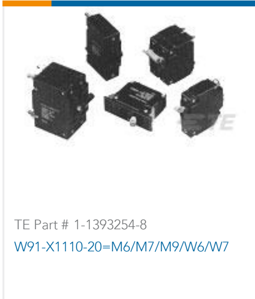
TE Part # 1-1393254-8 W91-X1110-20=M6/M7/M9/W6/W7