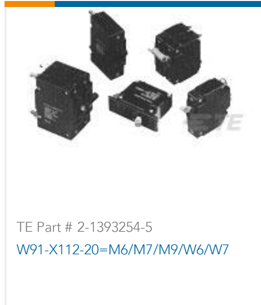
TE Part # 2-1393254-5 W91-X112-20=M6/M7/M9/W6/W7