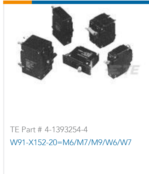
TE Part # 4-1393254-4 W91-X152-20=M6/M7/M9/W6/W7