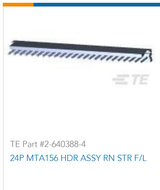
TE Part #2-640388-4 24P MTA156 HDR ASSY RN STR F/L