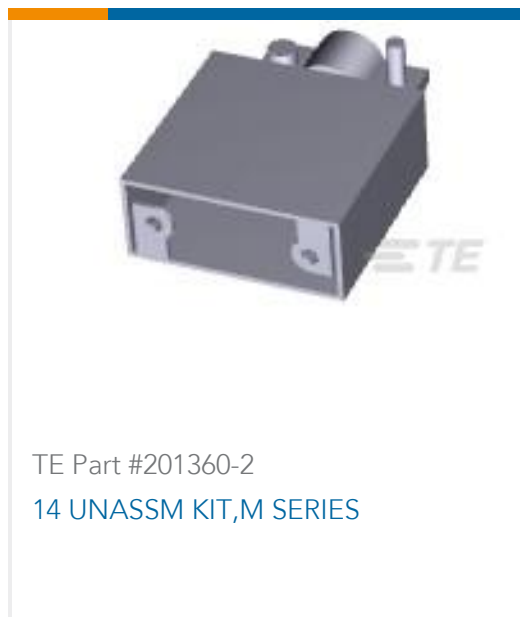
TE Part #201360-2 14 UNASSM KIT,M SERIES