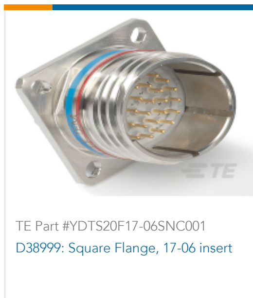
TE Part #YDTS20F17-06SNC001 D38999: Square Flange, 17-06 insert