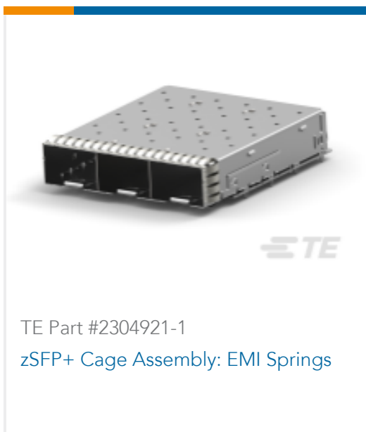
TE Part #2304921-1 zSFP+ Cage Assembly: EMI Springs