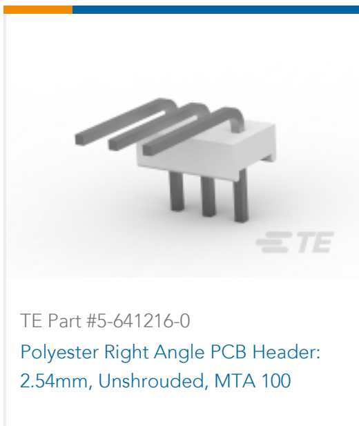
TE Part #5-641216-0 Polyester Right Angle PCB Header: 2.54mm, Unshrouded, MTA 100