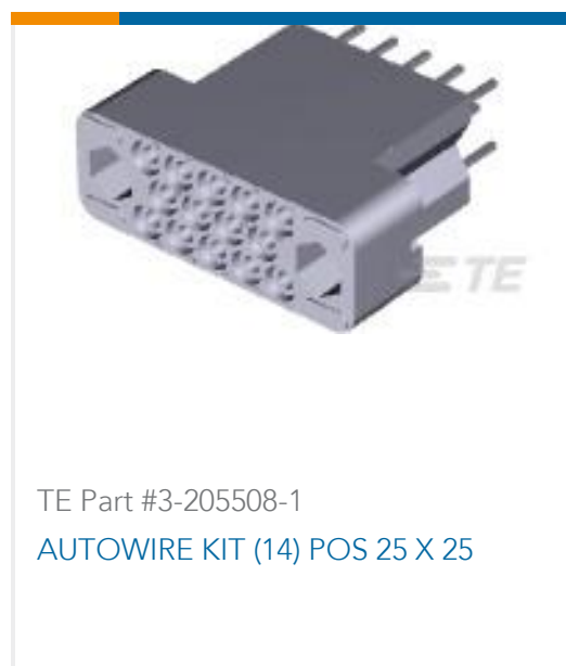
TE Part #3-205508-1 AUTOWIRE KIT (14) POS 25 X 25