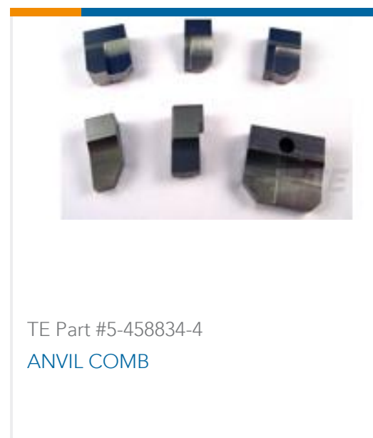
TE Part #5-458834-4 ANVIL COMB