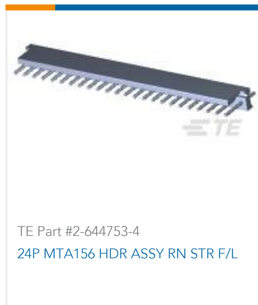
TE Part #2-644753-4 24P MTA156 HDR ASSY RN STR F/L