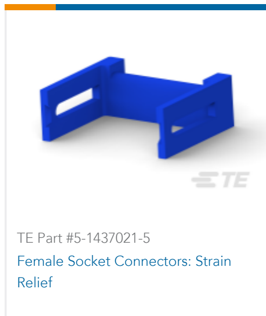
TE Part #5-1437021-5 Female Socket Connectors: Strain Relief