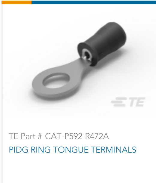
TE Part # CAT-P592-R472A PIDG RING TONGUE TERMINALS