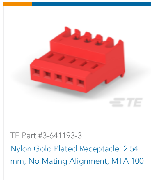
TE Part #3-641193-3 Nylon Gold Plated Receptacle: 2.54 mm, No Mating Alignment, MTA 100