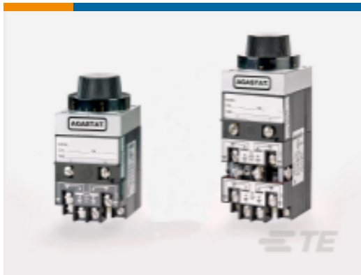
TE Part # 2-1423159-6 7012PD=RLY,STD,ON,2P,125VDC,50