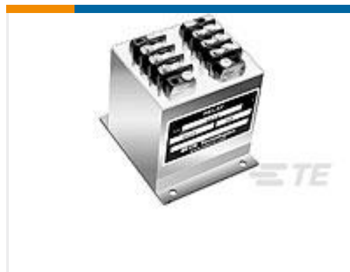
TE Part #1618096-3 910-3X=WILMAR PHASE SEQUENCE