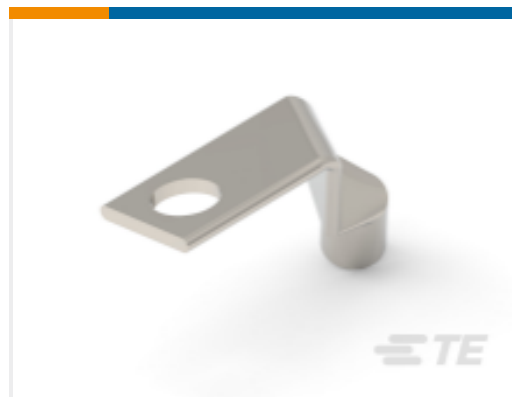
TE Part #696469-1 AMPOWER,2,3/8,TIN,90,30 DEG BL