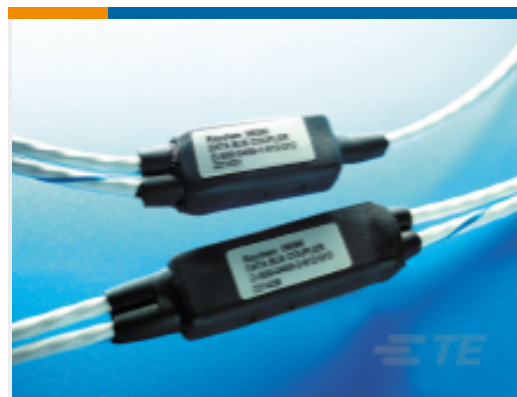
TE Part #455188-000 D-500-0255-021-02