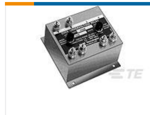
TE Part #5-1618071-6 253-5X=WILMAR OVER /UNDERVOLTAG