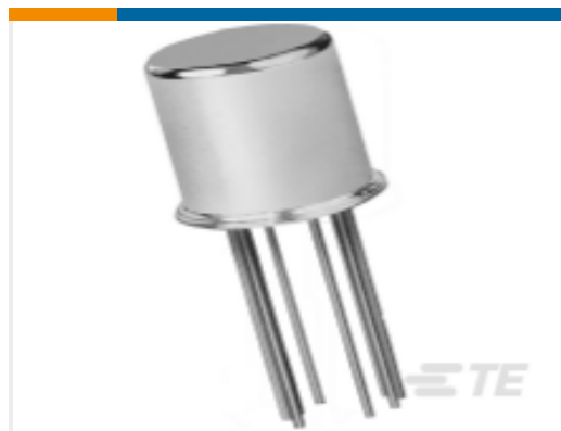
TE Part #6-1617540-4 J1MAP-6XL=M39016/7-016L