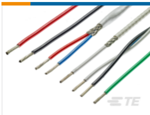
TE Part #306409-000 44AM1141-20-0/2/5/9-9