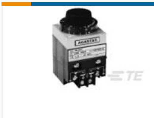
TE Part #3-1423157-4 7012BI=RLY,STD,ON,2P,240VAC,6