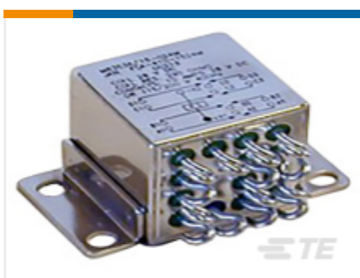
TE Part #4-1617813-6 TD228-7500P=TDFO .75 SEC M83726 /28-7500P