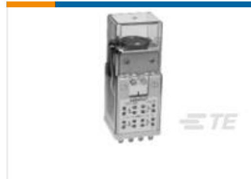
TE Part #1423155-6 GPDN=RLY,GEN,PURP,125VDC