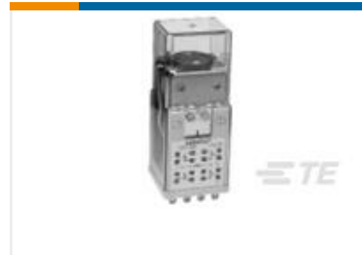
TE Part #1423155-5 GPD=RELAY, 125VDC