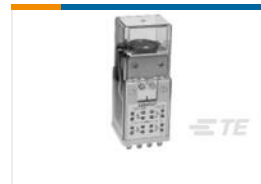
TE Part #1423155-4 GPCN=RELAY, 48VDC W/BLOWOUT DE