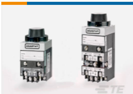
TE Part #1-1437453-7 7022BCX=RLY,STD,OFF,2P,240VAC