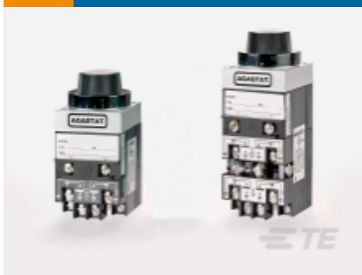
TE Part # 1423157-5 7012AC=RLY,STD,ON,2P,120VAC,15