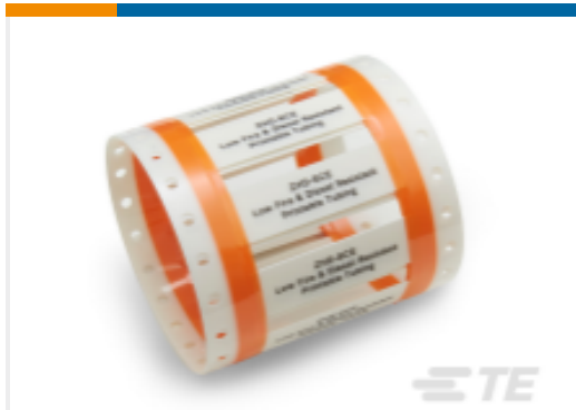
TE Part #EC9856-000 ZHD-SCE LFH & FLUID RESISTANT SLEEVES