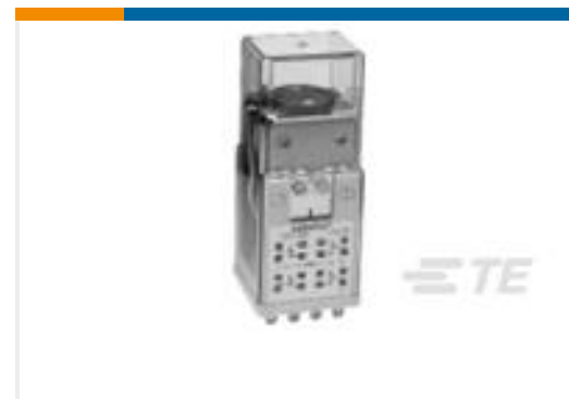
TE Part #1-1423155-5 GPFN=RLY,GEN,PURP,250VDC