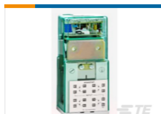
TE Part #1423155-7 GPDNC756=RLY,GEN,PURP,125VDC,