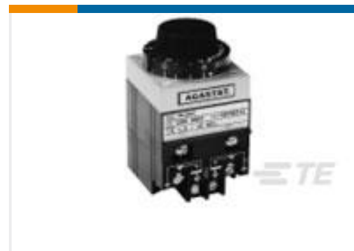
TE Part #1-1423162-8 7022AK=RLY,STD,OFF,2P,120VAC,1