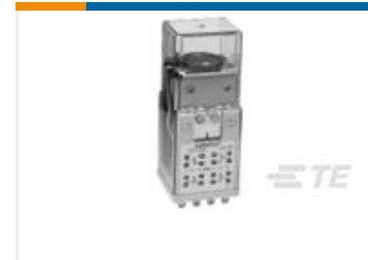
TE Part #1423155-3 GPC=RELAY,48VDC