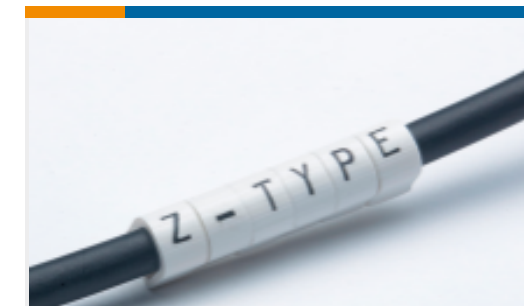
TE Part #EC1253-000 Z-TYPE PUSH-ON MARKERS