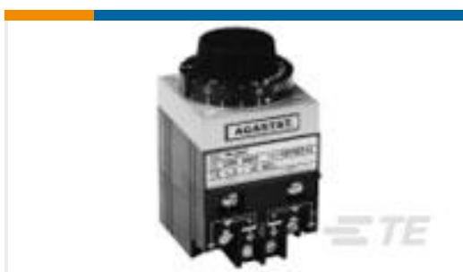
TE Part #6-1755142-4 7022WDIM=RLY,STD,OFF,2P,96V,50S,I, M