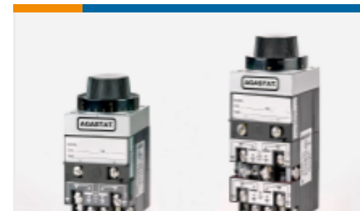
TE Part #1755170-1 7022OCIM=RLY,STD,OFF,2P,24V,15S,I, M