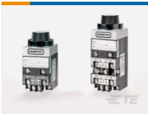
TE Part # 1423162-5 7022AC=RLY,STD,OFF,2P 120VAC,1