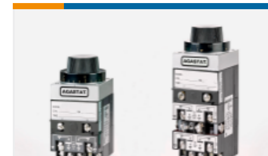
TE Part #7-1472995-0 7012WDS=RLY,STD,ON,2P,96V,50S,S