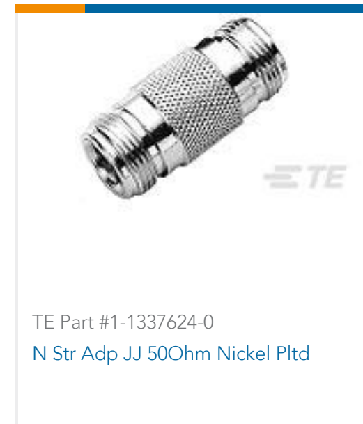
TE Part #1-1337624-0 N Str Adp JJ 50Ohm Nickel Pltd TEMP