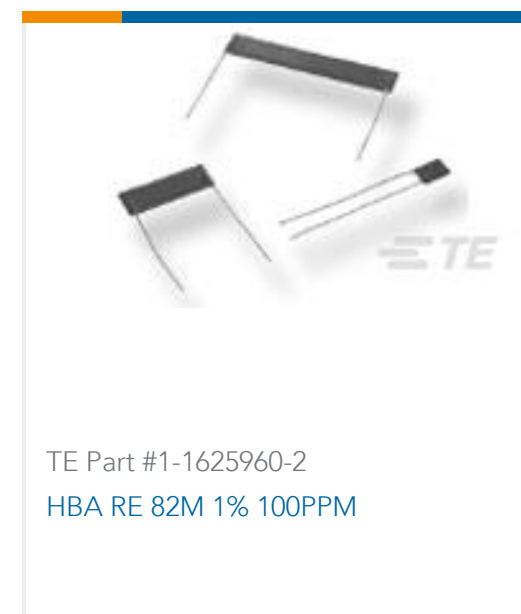
TE Part #1-1625960-2 HBA RE 82M 1% 100PPM