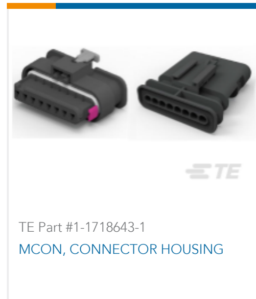
TE Part #1-1718643-1 MCON, CONNECTOR HOUSING