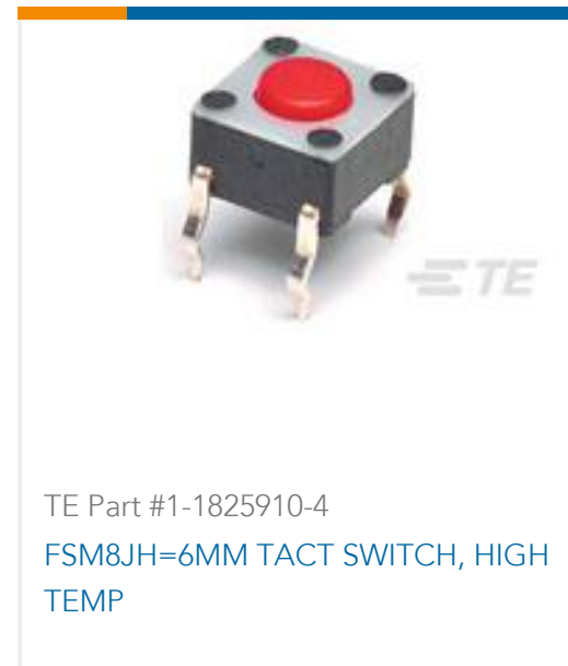
TE Part #1-1825910-4 FSM8JH=6MM TACT SWITCH, HIGH TEMP