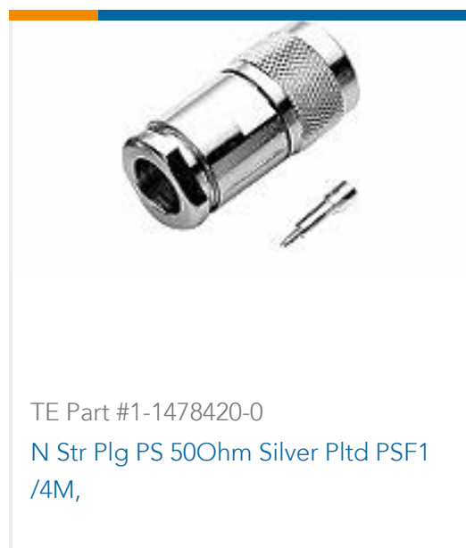
TE Part #1-1478420-0 N Str Plg PS 50Ohm Silver Pltd PSF1 /4M,