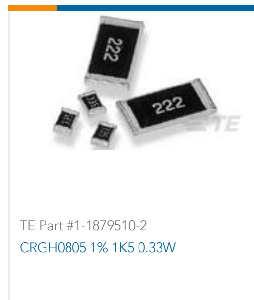
TE Part #1-1879510-2 CRGH0805 1% 1K5 0.33W