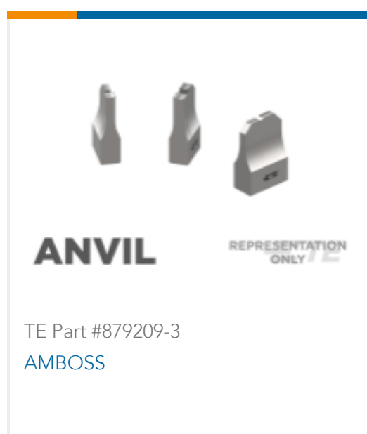
TE Part #879209-3 AMBOSS