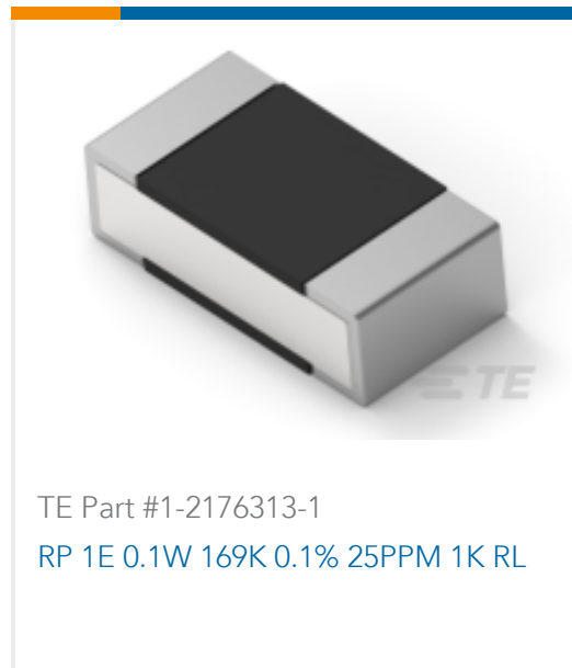
TE Part #1-2176313-1 RP 1E 0.1W 169K 0.1% 25PPM 1K RL