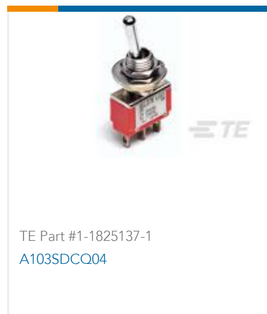
TE Part #1-1825137-1 A103SDCQ04