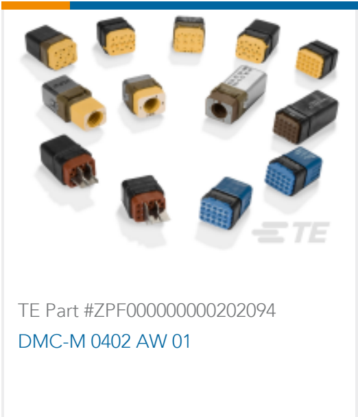
TE Part #ZPF000000000202094 DMC-M 0402 AW 01