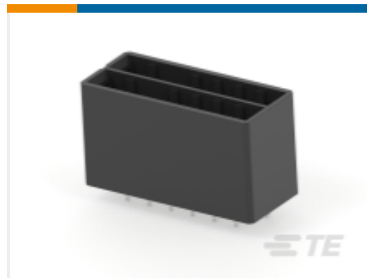
TE Part #1-316133-3 DYNAMIC 3200 HDR ASSY