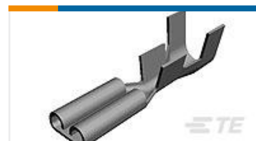
TE Part #170048-2 110 FASTON, REC., 24-20 AWG, TPBR