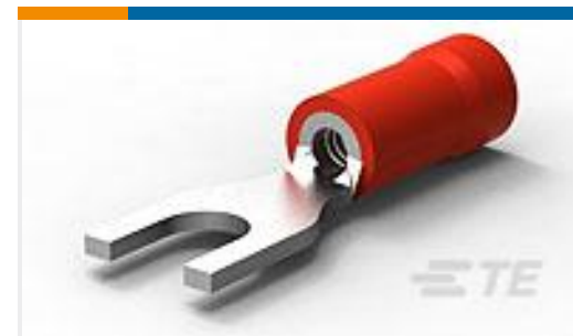
TE Part # 171551-1 P.G SPADE