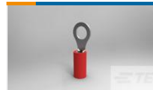
TE Part # 171506-2 PIDG RING (22-18)