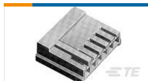
TE Part #171822-2 EIS REC. HSG 2P-NATURAL