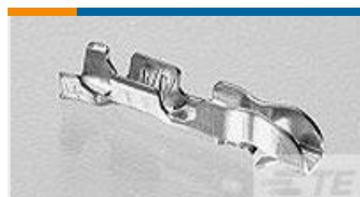
TE Part #170204-2 EIS CONTACT