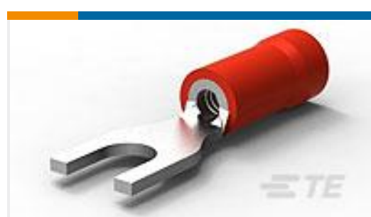
TE Part # 171551-2 P.G SPADE