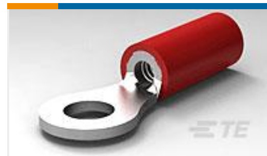
TE Part # 170780-1 P.G RING UL.CSA(22-18)