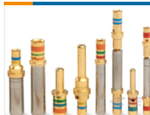
TE Part #ZPF000000000000486 014-1015-20