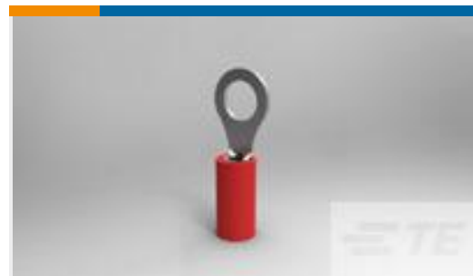
TE Part # 171506-1 PIDG RING (22-18)