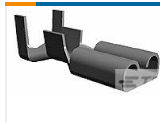
TE Part #170038-4 187 FASTON, REC., 20-16 AWG, TPPB