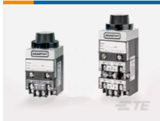
TE Part # 1-1423159-9 7012PB=RLY,STD,ON,2P,125VDC, 5