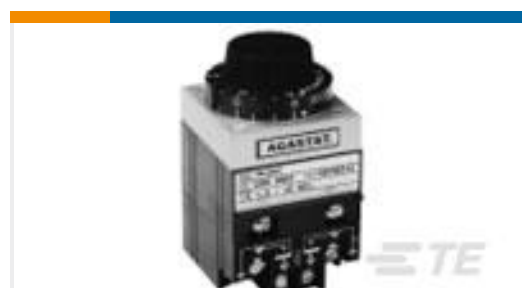
TE Part #2-1423157-7 7012AKX=RLY,STD,ON,2P,120VAC,3