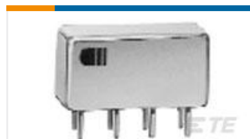
TE Part #1617030-2 HFW1201B00 = HFW 1/2 SIZE RELA