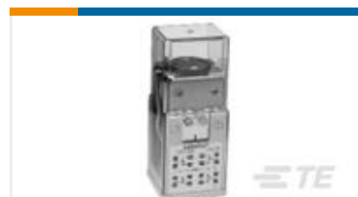
TE Part #1-1423155-5 GPFN=RLY,GEN,PURP,250VDC