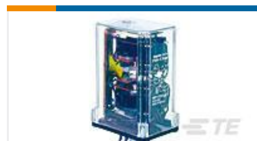
TE Part #2-1393100-5 KBP-11DG-110=KA/KB/KC/KR