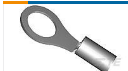
TE Part #324911-1 TERMINAL,SOLIS R 12-10 6 TAPE