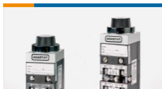
TE Part #3-1755148-2 7012SKLX=RLY,STD,ON,2P,250V,300S, L,X