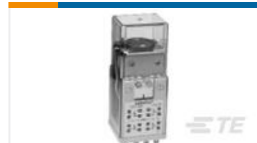
TE Part #1423155-3 GPC=RELAY,48VDC