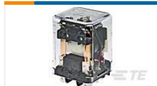
TE Part #1423116-2 KUEP-11A35-120=RELAY,GENPUR,QC