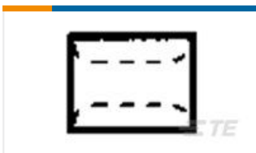
TE Part #323754 SPLICE,SOLIS PARA HR 12-10