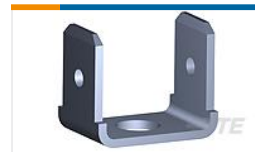
TE Part #41480 FASTON .250 SERIES (6.3 MM) TAB TPBR