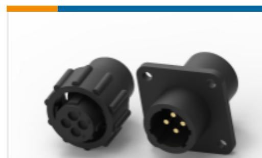
TE Part #206061-1 CPC SERIES 1