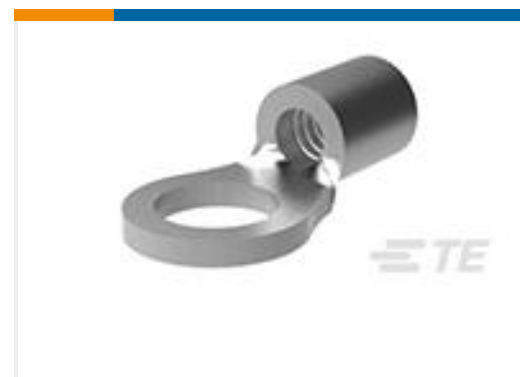
TE Part #34112 SOLIS R 22-16COMM 22-18MIL 10