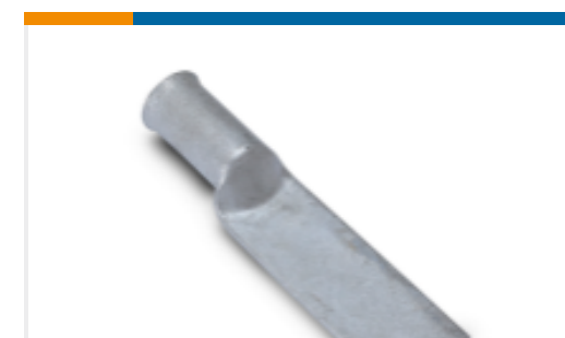
TE Part #325614 AMPPOWER TERMINAL WO HOLE LONG BARREL