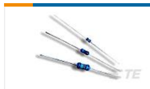
TE Part #2-1676913-9 YR1 0.1% 20K5