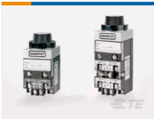
TE Part # 2-1423162-9 7022BK=RLY,STD,OFF,M2P,240VAC,