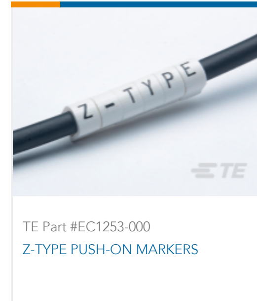
TE Part #EC1253-000 Z-TYPE PUSH-ON MARKERS