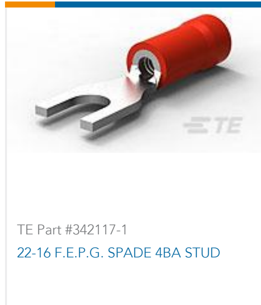
TE Part #342117-1 22-16 F.E.P.G. SPADE 4BA STUD