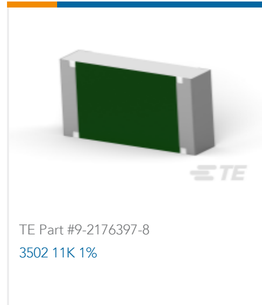
TE Part #9-2176397-8 3502 11K 1%